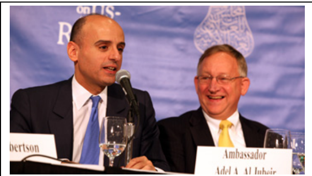
H.E. Adel A. Al-Jubeir, Ambassador of the Kingdom of Saudi Arabia to the United States, and The Hon. James B. Smith (Brigadier General, USAF, Ret.), Ambassador of the United States to the Kingdom of Saudi Arabia, at the National Council on U.S.-Arab Relations' 2009 Arab-U.S. Policymakers Conference.

Also lost upon many observers was awareness of the decreasing likelihood that the two countries would soon if ever again engage in actions or reactions that would place the long term strategic and special nature of the bilateral relationship in jeopardy. A major reason was the strategic, financial, geopolitical, and related importance of their respective investments in each other's economy. The sheer volume and value of these investments meant that both would incur immense damage were they to allow the emotions of a given moment on either side of the relationship to provoke actions by one against the other, entailing damage and costs that could not be justified or easily repaired. On America's side, it was not long before the rest of the world was informed that the nature and extent of U.S. investments in Saudi Arabia's economy were second to none worldwide and that the same was true regarding the number and value of American-Saudi Arabian joint commercial ventures.