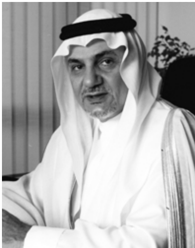
HRH Prince Turki Al-Faisal