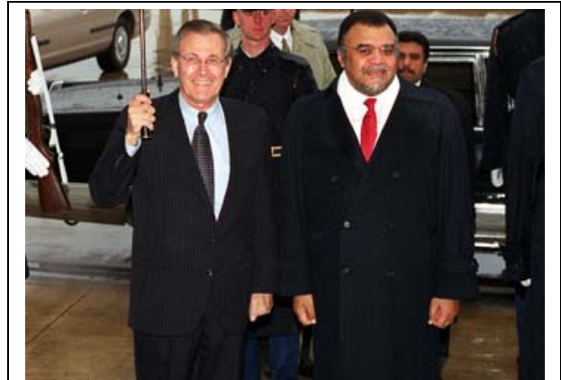
Secretary of Defense Donald H. Rumsfeld (left) escorts Prince Bandar Bin Sultan Bin Abdul Aziz (right), the Ambassador of the Kingdom of Saudi Arabia to the United States, through an honor cordon and into the Pentagon for a meeting on Feb. 5, 2001.

Although it was not always clear that the Saudi Arabian-United States special relationship would survive the eight-year Iran-Iraq war intact, this is indeed what happened. So, too, would the American-enhanced deterrence and defense capacities of Saudi Arabia serve the interests of both countries against those elements within the post-Shah revolutionary government in Tehran that were determined to overthrow the government in Riyadh. In response to the perceived threats that the revolutionary government in