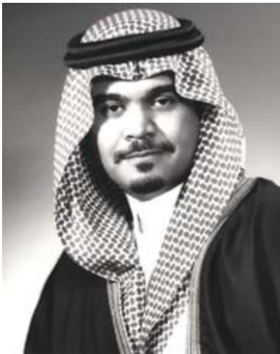
HRH Prince Bandar bin Sultan