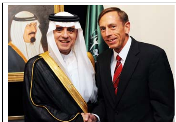
Ambassador Adel Al-Jubeir with General David Petraeus, Director of the Central Intelligence Agency, at Saudi Arabia National Day 2011.

On the other hand, Al-Jubeir's efforts have been strengthened by his, Americans', and many others' acknowledging that many countries' governments, were they to construct an international bilateral relationship of their choosing, would readily trade places with either the United States or Saudi Arabia were there ever to be an opportunity to do so. They would do so for reasons that, as many have long argued, are eminently understandable. They would do so in the hope of replicating for themselves the unparalleled benefits that Americans, Saudi Arabians, and countless others have derived from Riyadh's and Washington's bilateral relationship. Their frame of reference: nearly seven decades of extraordinary efforts of thousands of citizen leaders on both sides of the American and Saudi Arabian relationship. And not last nor least, among the thousands of mostly unknown and unsung heroes and heroines on both sides, from the extraordinary efforts of the three Saudi Arabians and their times as depicted here.