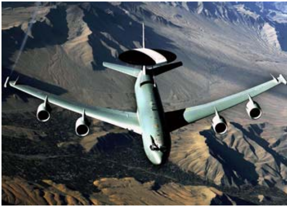
The E-3 Sentry AWACS aircraft is used by the United States, the United Kingdom, France, NATO, and Saudi Arabia.

From beginning to end, the essence of this legislative battle between Israelis and Americans was less about the alleged threat that such a sale of defensive equipment would arguably pose to Israel's qualitative edge over the combined militaries of the entire Arab world. Indeed, the White House and the U.S. Defense Department had gone out of their way to assuage the pro-Israeli camps' stated concerns in this regard. In addition, American defense specialists practically assured Israeli military leaders in advance that the sale would in no way occur if Israel's national sovereignty, political independence, or territorial integrity would be at risk or impaired as a result. To drive this point home, the White House and the U.S. Department of Defense were even prepared to further the gap between Israel's and the Arab world's combined military