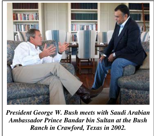
President George W. Bush meets with Saudi Arabian Ambassador Prince Bandar bin Sultan at the Bush Ranch in Crawford, Texas in 2002.

The "Joint Commission," as it would become known, had a pronounced but largely unstated threefold strategic purpose. First, the commission would in effect allow for the re-circulation of the hundreds of millions of dollars that Saudi Arabia had accrued as a result of the sharp increases in international oil prices that followed in the wake of the October 1973 Arab-Israeli War. Lost upon many observers since then was that was the last time in which the so-called Arab "oil weapon" or embargo was administered by Saudi Arabia and other Arab oil-producing nations against such countries as the United States, Great