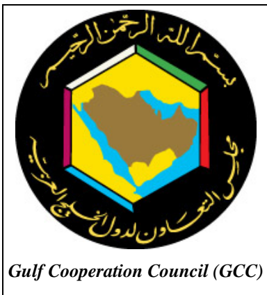
Gulf Cooperation Council (GCC)

During this same period of the 1980s -- starting on May 28, 1981, to be exact -- Mr. Al-Jubeir witnessed the formation of the six member-nation Gulf Cooperation Council (GCC). Comprised of Bahrain,