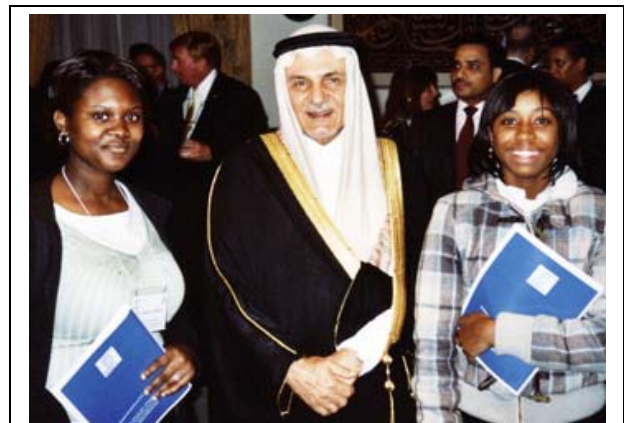
HRH Prince Turki Al Faisal Al Sa'ud, manifesting his trademark people-to-people touch, takes time out from an informal chat with two high school students from New Era Academy (Baltimore, Maryland) at the National Council on U.S.-Arab Relations 2006 Arab-U.S. Policymakers Conference.

Many, too, were taken aback by a member of the Saudi Arabian ruling family who, unlike most diplomats, was as much at home, if not more so, in grassroots venues throughout the United States, than he was with fellow royalty and his ministerial counterparts, whether in his native country or elsewhere. Even more bewildering to Washington officialdom for an extended period was whether it would be appropriate to ignore, accommodate, remain silent, condemn, or applaud when Prince Turki proceeded