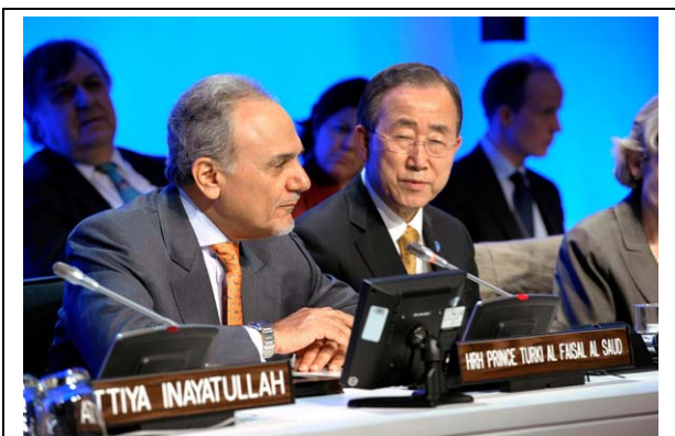
HRH Prince Turki Al Faisal bin Abdulaziz Al Saud (left), Head of Saudi Arabia's King Faisal Centre for Research and Islamic Studies, speaks at the panel discussion organized by UNESCO, "Building peace: Reconciliation through the power of education, the sciences, culture, and communication." Pictured beside him is UN Secretary-General Ban Ki-Moon.

That all three of the Saudi Arabian Ambassadors to the United States depicted herein have made extraordinary contributions to strengthening and expanding the special Saudi Arabian-U.S. relationship,