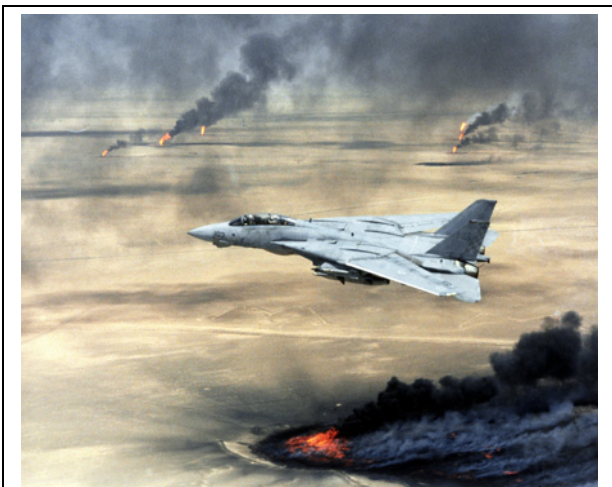
US Navy F-14A Tomcat in flight over burning Kuwaiti oil wells during Operation Desert Storm

Joining them were the militaries of a dozen Arab countries and units from South Asian, Southeast Asian, African, and even Latin American countries' armed forces, all united in their determination to do