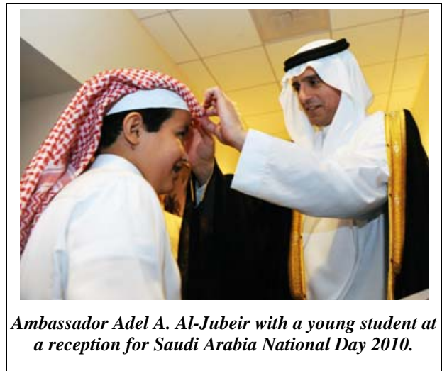
Ambassador Adel A. Al-Jubeir with a young student at a reception for Saudi Arabia National Day 2010.

Al-Jubeir graduated summa cum laude [With Highest Honors] from the University of North Texas in 1982 with a Bachelor's Degree in Political Science and Economics. He went on to earn a Master's Degree in Political Science and International Relations from Georgetown University's Graduate School of Foreign Service in 1984. He entered Saudi Arabia's Diplomatic Corps in 1986 and served as Special