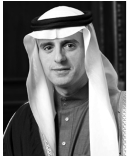
H.E. Adel A. Al-Jubeir