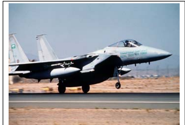
An F-15 Eagle aircraft of the Royal Saudi Air Force takes off during Operation Desert Shield.

At issue in the first instance was Saudi Arabia's quest to purchase American-manufactured F-15 fighter aircraft. In the kingdom's favor was that buying such modern advanced state-of-the-art fighter aircraft would enhance the safety of the kingdom's citizenry in the event that they should be attacked by the armed forces of a hostile country. In constructing this narrative in support of the purchases, it was not as though Riyadh's defense strategists were concocting threats. Such threats existed. Indeed, after the October 1973 Arab-Israeli War ended, as separate American and British assessments of the kingdom's longer term defense needs concurred, the most dangerous potential threats came from the north, as represented by then-Arab socialist, revolutionary, and Ba'thist Iraq, and from the south in the form of an anomaly in Arab and Islamic history that has never existed before or since -- the then-revolutionary Marxist-Leninist People's Democratic Republic of Yemen.