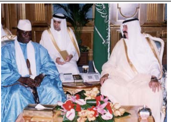
(Right to Left) King 'Abdullah bin 'Abd al-'Aziz Al Sa`ud, Custodian of the Two Holy Mosques, and Adel Al-Jubeir meet with the President of Zambia

Not least among other impressive and far-reaching developments occurring during Adel Al-Jubeir's long and steady rise in his country's circles of foreign affairs practitioners was the culmination of his and his predecessors' efforts in support of the kingdom's successful entry into the World Trade Organization (WTO). None among the country's leaders could possibly have imagined that the process of becoming a full-fledged member of the world's most powerful trade organization would be automatic or pro forma. Nor could they have envisioned that the process would be devoid of a diverse range of legal, technical,