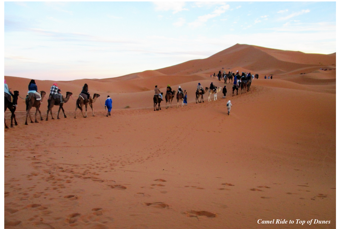
Camel Ride to Top of Dunes

cooked blend of meat and vegetables) was incredible. We slept that evening in Bedouin tents, admittedly rather highline tourist style with Western amenities. The next morning some of the group trekked back to the dunes for the sunrise. From the top of the center's building, the rest of us observed morning life in the surrounding Bedouin encampments and village.