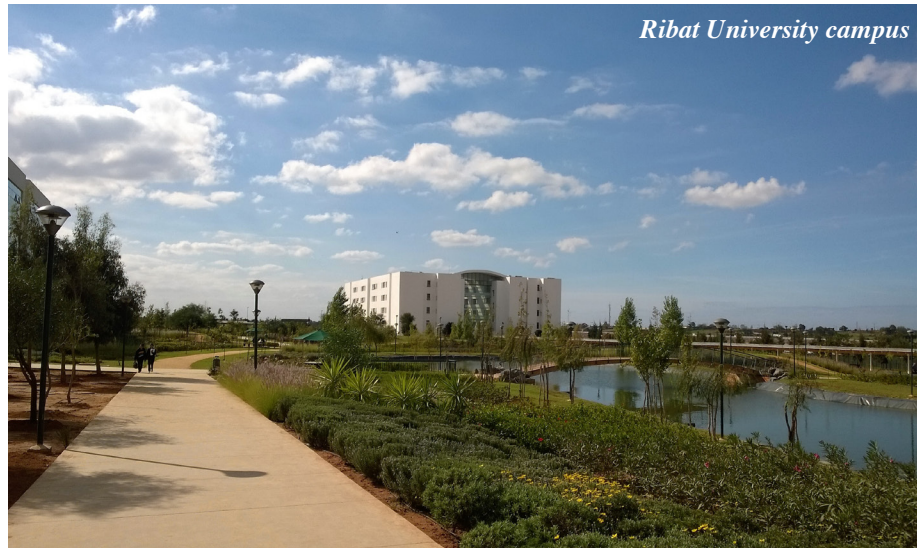
Ribat University campus

Funded by a grant from the Converse College Golden Club (50th Year Reunion Class), seven senior and junior members of the Converse MAL delegation and three sponsors participated in the first Rabat (Morocco) International University MAL, hosted November 11-12, 2016, at the new French-language, European educational model Universite Internationale