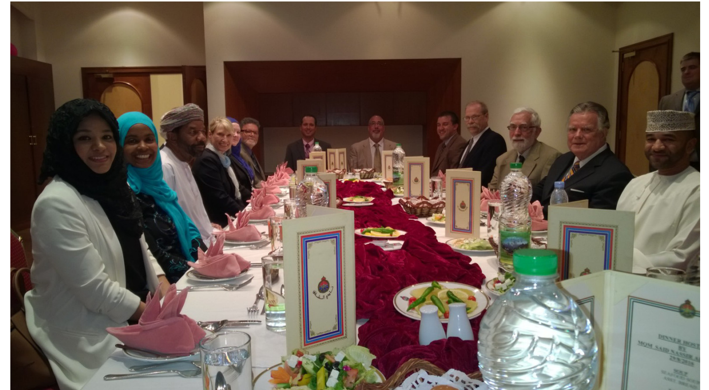
Banquet at Royal Military Officers Club

Oman's Vision 2020 plan emphasizes tourism as a significant area of diversification of the economy. Presently, approximately 75% of Oman's tourism comes from Arabian Gulf neighbors with Europe, particularly Italy, Germany, and the United Kingdom, next. Oman projected in 2015 as much as a 10% increase in tourist numbers. Hotel and resort expansion is imperative. In the last couple of years, Westin,