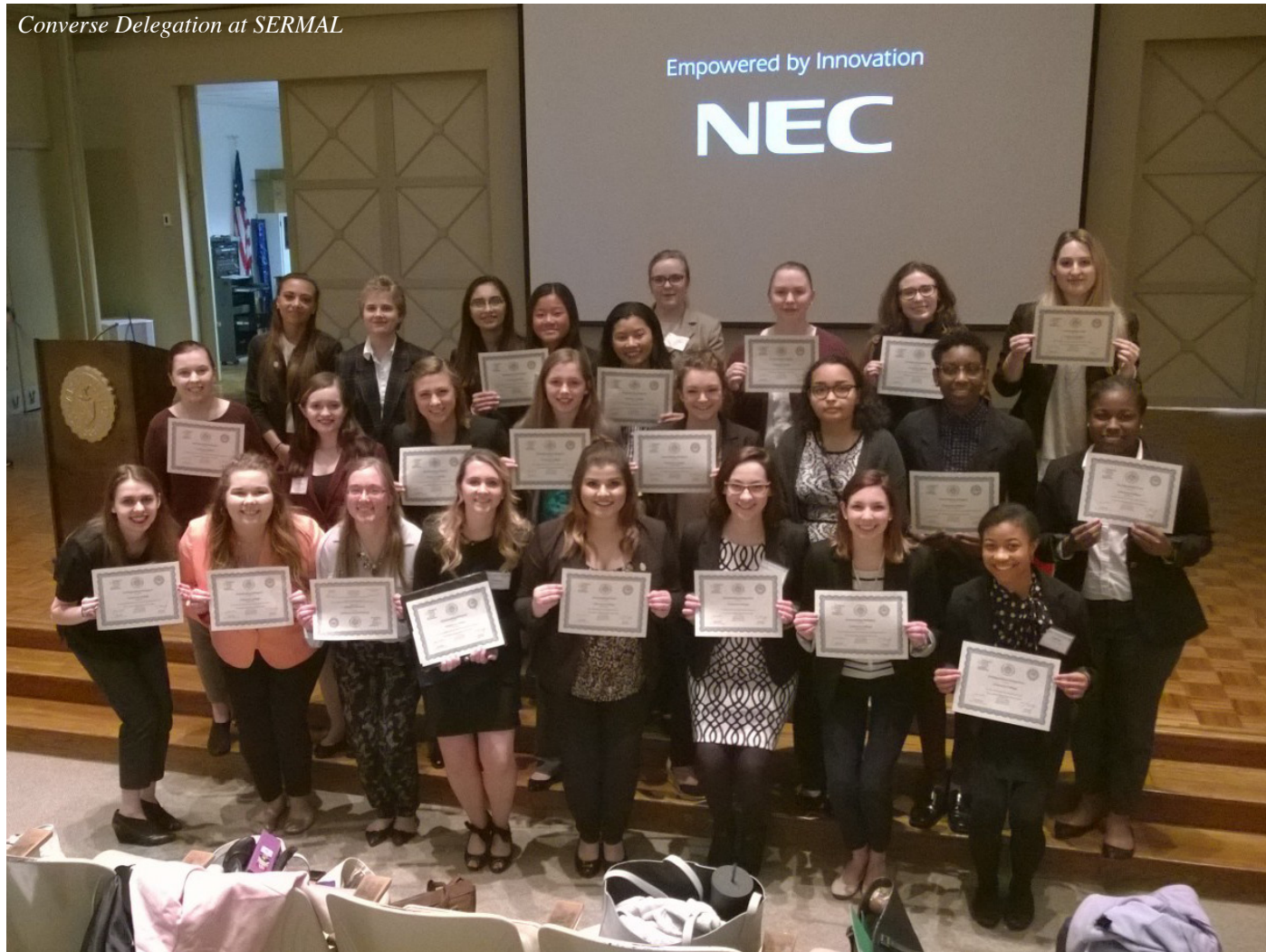
Converse Delegation at SERMAL