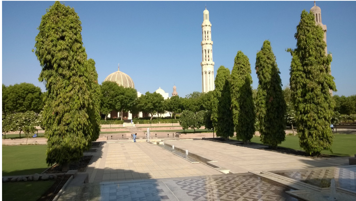
Grounds of the National Mosque