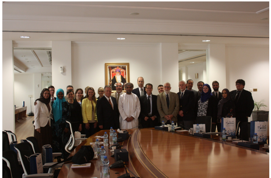
Meeting at ITHRAA, Inward Investment and Export Development Agency

Converse College 580 East Main Street Spartanburg, SC 29302