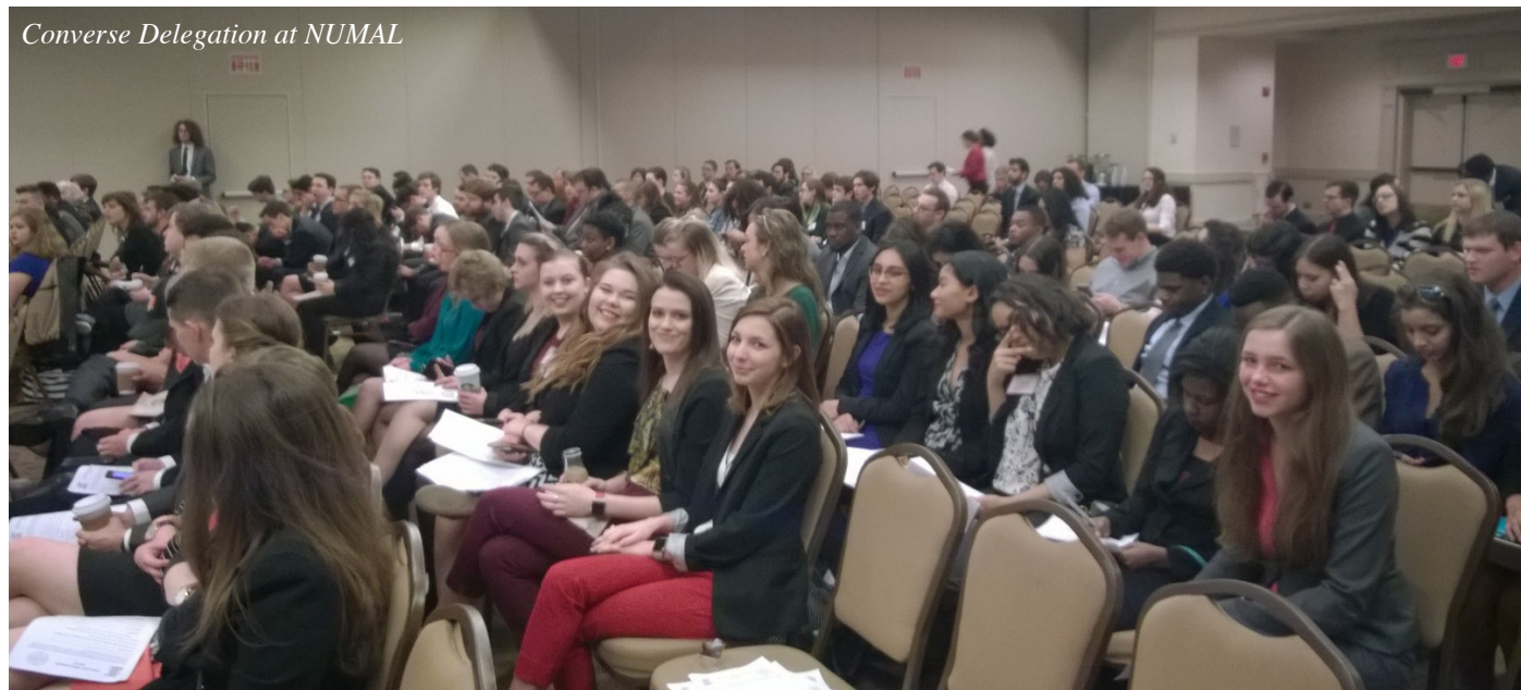
Converse Delegation at NUMAL