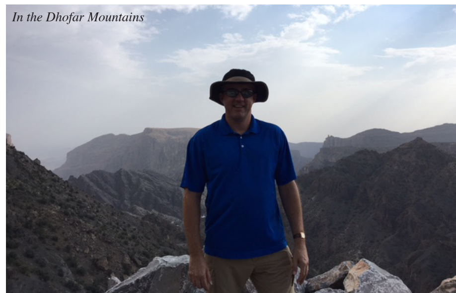
In the Dhofar Mountains

The visit to the tomb of the Prophet Job stands out as a moment of religious pluralism on the trip. The memorial site is located in Beit Zarbij which is 27 kilometers outside of Salalah. The site includes a small mosque in addition to the building where the tomb is located. Outside of that building is an ancient prayer area with prayer rugs lined up next to each other on the ground. We mingled among the pilgrims making their visit to this holy site, taking pictures