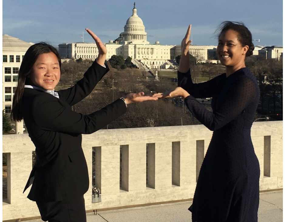
First Model Trip to DC as Freshman with my Senior Partner

Converse College 580 East Main Street Spartanburg, SC 29302