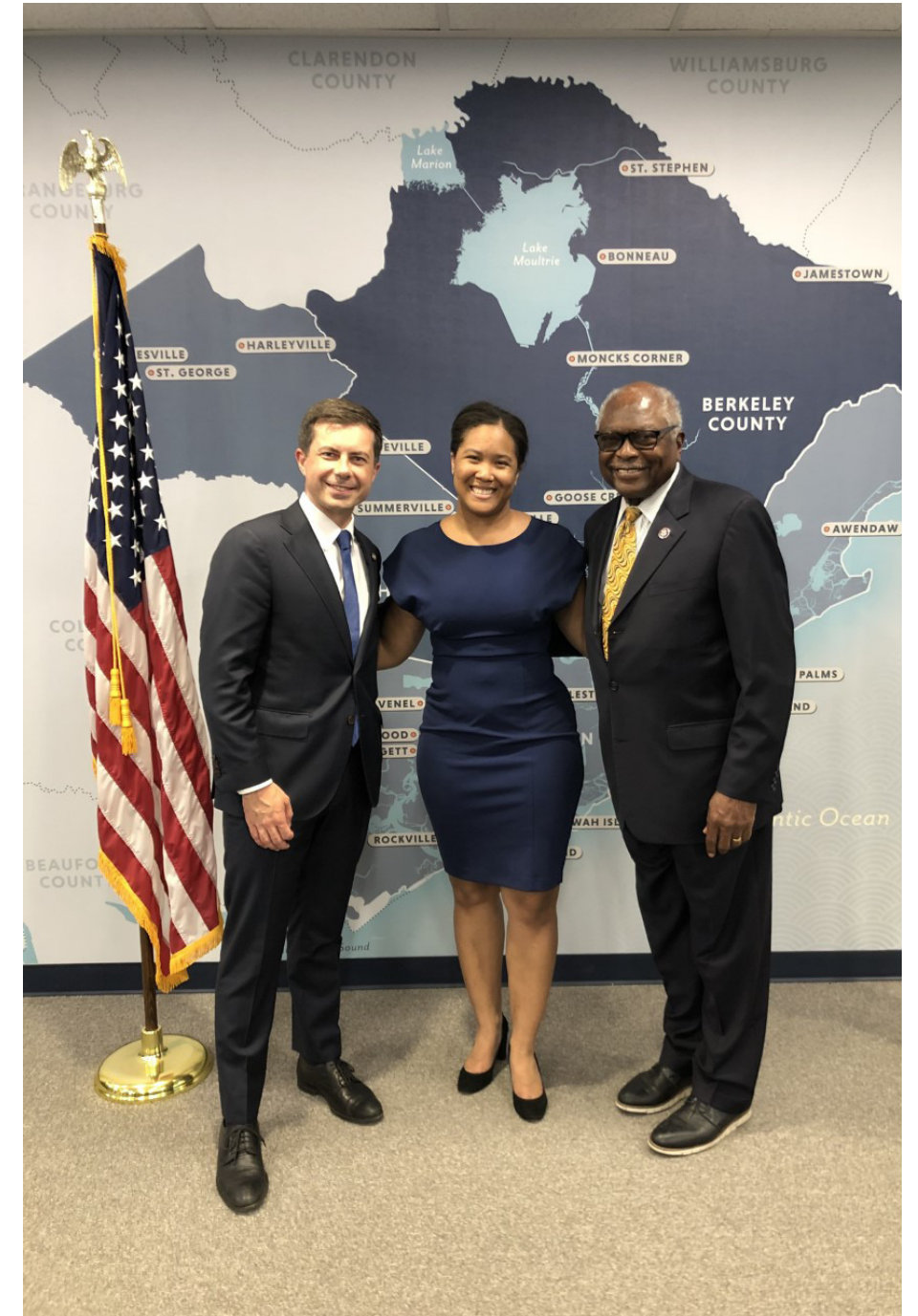
With Secretary of Transportation and Congressman James Clyburn

didn't always listen to us as he should.