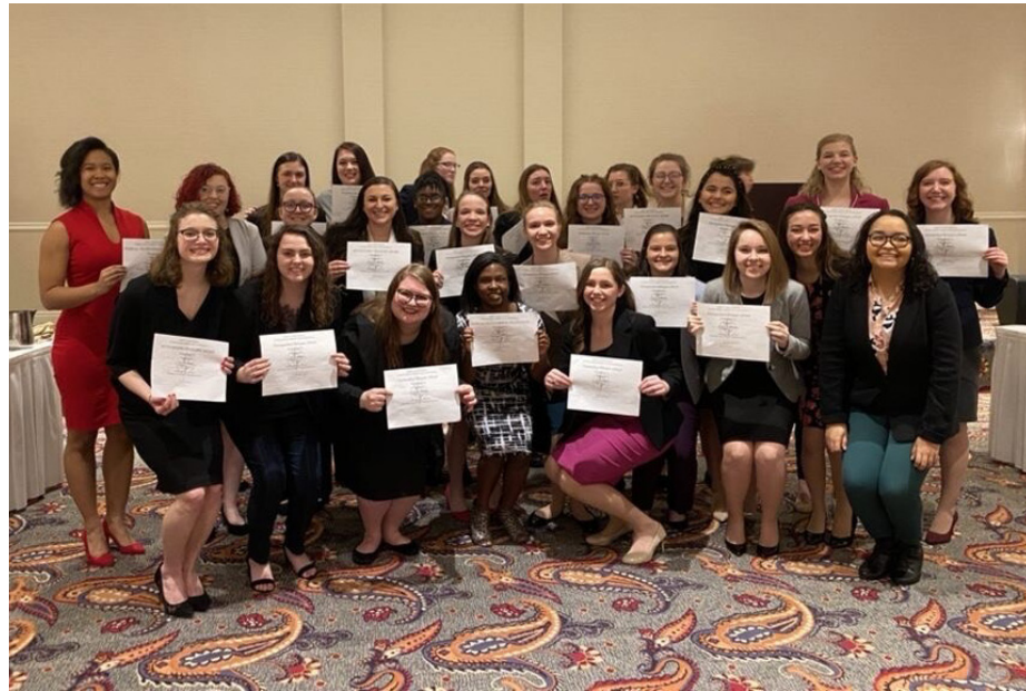
My delegation as Head Delegate and Secretary General of NUMAL 2021

stone to my wonderful career in Model Programs. My personal story follows.