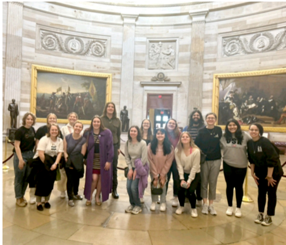
Delegation at U.S. Capitol

The 2024 National University Model will meet March 22-24 at a yet undetermined location.