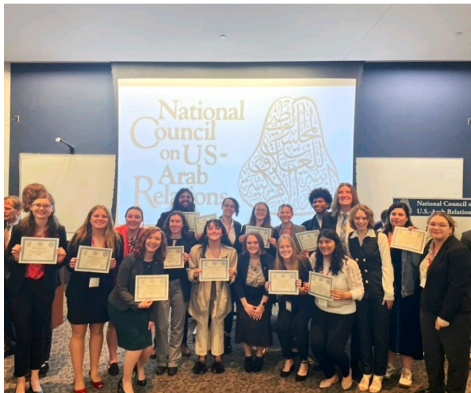
Outstanding NUMAL Iraq Delegation