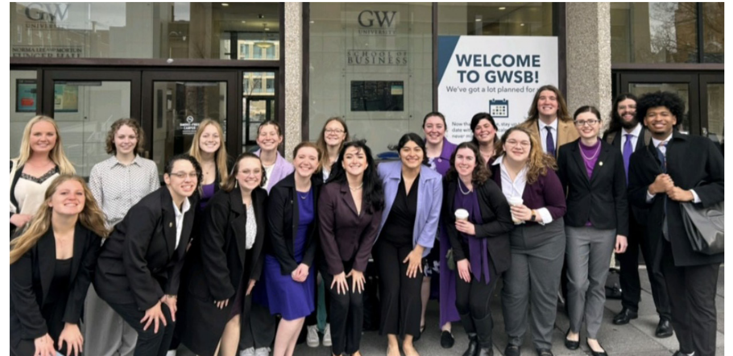
NUMAL 2023 Delegation at GWU