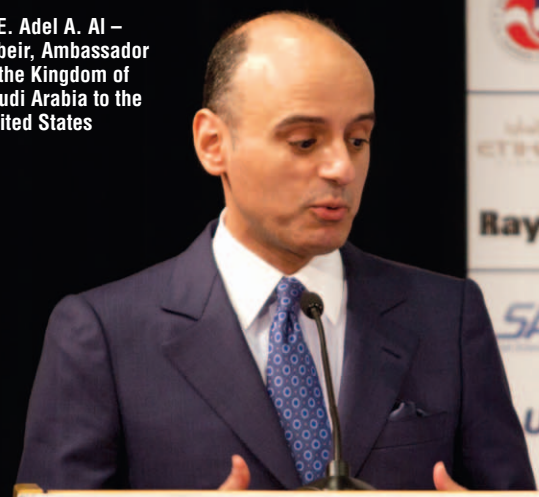
H.E. Adel A. Al-Jubeir, Ambassador of the Kingdom of Saudi Arabia to the United States