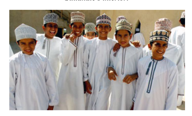
Schoolboys break from their studies at a school in Nizwa.