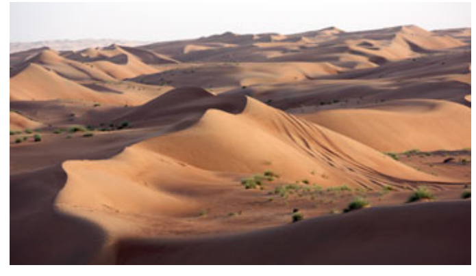
Malone Fellows explored the dunes of the Sharqiyyah Sands, an eastern extension of the Rub' Al-Khali (The Empty Quarter), the world's largest desert.