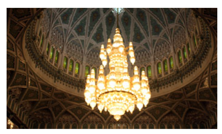
Chandelier in The Sultan Qaboos Grand Mosque in Oman's Capital Territory that measures 14 meters tall.