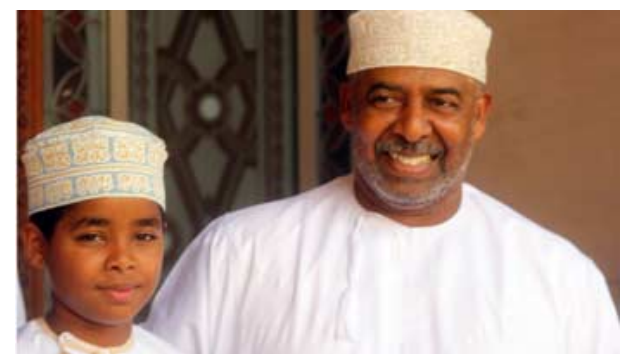
The Malone Fellow delegation's Omani guide visiting Nizwa, historical capital of the former Imamate of Oman and located deep in the Sultanate's interior.