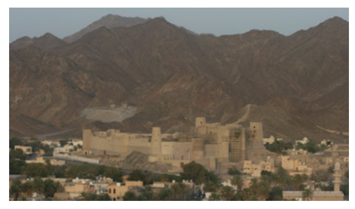
Oman's inland fortress and traditional walled settlement of Bahla, presently under restoration, has been designated by the United Nations as a World Heritage Site.