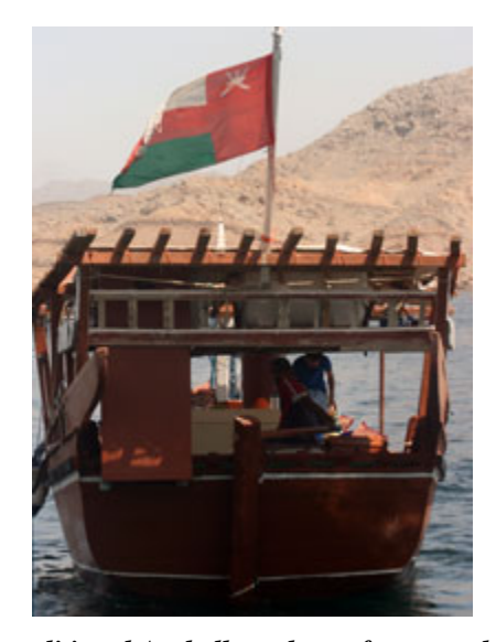
A traditional Arab dhow, hewn from wood and crafted by hand in the manner of Omani shipwrights and mariners of yesteryear, sails near a cove adjacent to the Strait of Hormuz.