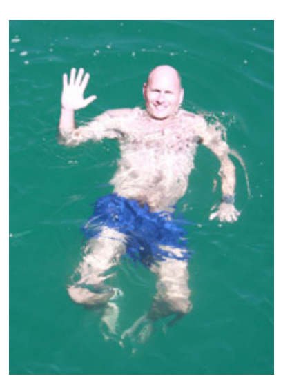
A Malone Fellow swims in one of the many inlets adjacent to the Strait of Hormuz.