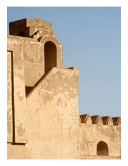
The Fellows visited Jabrin Castle, built in the 17th Century when Oman's capital moved there from Nizwa.