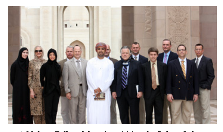
A Malone Fellow delegation visiting the Sultan Qaboos Mosque in Oman's Capital Territory.