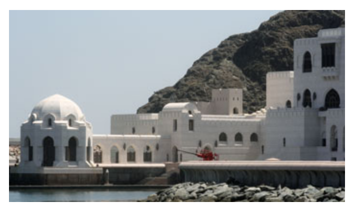
The waterfront of Muscat, capital of Oman and one of Arabia's most historically fabled ports.