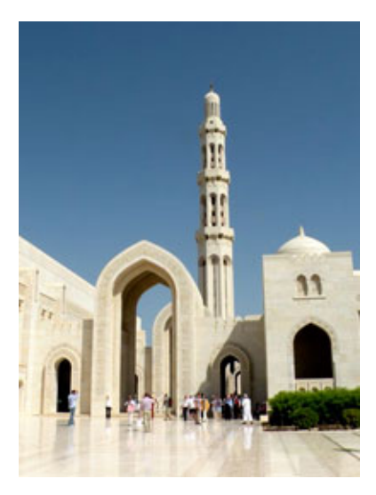
An exterior view of the Sultan Qaboos Grand Mosque in Oman's Capital Territory.