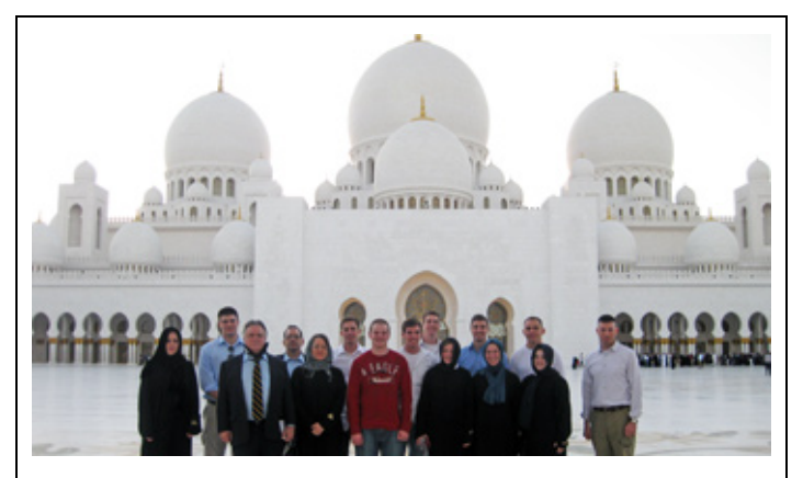
The National Council's delegation from the U.S. Naval Academy visits the Sheikh Zayed Mosque in Abu Dhabi.

Academy (USNA) in Annapolis, Maryland. The Academy's delegation was comprised of twelve Midshipmen and two faculty. The visit provided the Midshipmen an opportunity to explore the dynamics of some of the major economic, political, and social determinants of UAE culture as well as the country's modernization and development.