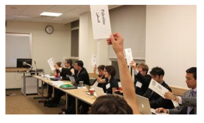
Student delegates vote on a resolution in the Council on Political Affairs.