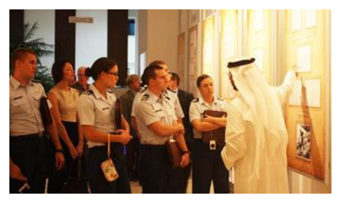
The Council's U.S. Air Force Academy delegation visits the UAE Ministry of Presidential Affairs' National Center for Documentation and Research in Abu Dhabi, one of the foremost centers of its kind in the Arab and Islamic worlds.