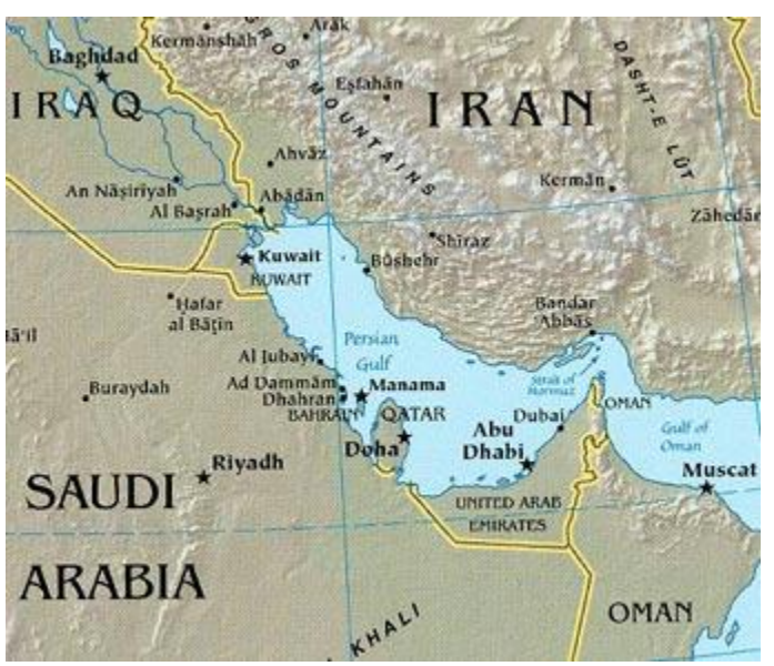
As these maps illustrate, the academic focus of the internship program is on Arabia and the Gulf which, despite being of vital strategic and economic importance globally, remains little understood by most Americans and many others.