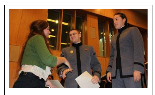
The Northeast Regional Model Secretary-General awards a certificate to student delegates from the United States Military Academy at West Point for outstanding representation of their country's policies and positions.

The 2011 Northeastern University Regional Area Model (NERMAL), convened at Northeastern University in Boston November 4-6, succeeded on multiple levels. Student delegates debated and passed resolutions on numerous diverse topics reflecting the real-life domestic dynamics and policy challenges presently facing all 22 of the League's Arab member-states. Schools participating in the 2011 Northeastern Regional Model included: Simmons College, University of Massachusetts Lowell, Northeastern University, Colby College, University of Massachusetts Boston, Fitchburg State University, Converse College, University of Pittsburgh, Bard