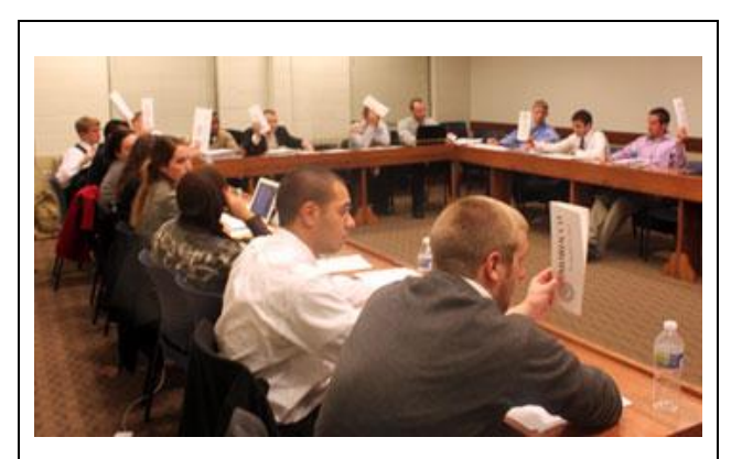
Student delegates vote on an amendment to a resolution in the Council on Environmental Affairs at Georgetown University's Capital Area Model.

The National Council, in partnership with the Georgetown University Graduate School of Foreign Service's Center for Contemporary Arab Studies, hosted the Third Annual Capital Area Regional Model November 12-