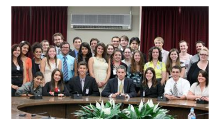
National Council Internship Program participants visited and were briefed by diplomats at the U.S. Department of State.