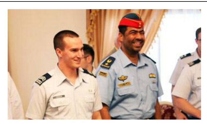
A U.S. Air Force Academy Cadet with an instructor from the Khalifa bin Zayed Air College.