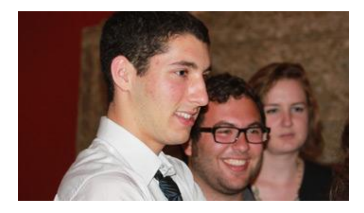
The interns gather for a final meeting at the Summer Wrap-Up Session before returning to their home universities to continue their studies.

Accordingly, one of the program's objectives is to increase the number of foreign affairs practitioners that are as knowledgeable of Arabia and the Gulf's internal and external dynamics as possible. To that end, most of the lectures address issues related to the member-states' systems of governance, political realities, economic and social development, as well as foreign affairs, on one hand, and, on the other, the relationships of the United States with this Arab sub-region and its neighbors -- and vice versa .