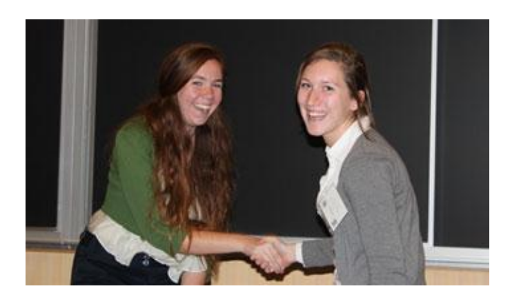
The Northeast Regional Model Secretary-General congratulates a Council Chair on her successful leadership of the Council of Arab Economic Ministers.