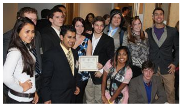
Student delegates display their award for Outstanding Delegation at the Northeast Regional Model.