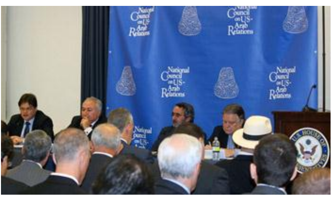
The National Council hosted a briefing event featuring leaders from the Gulf Research Center at the Rayburn House Office Building on Capitol Hill.

Audio, video, and pictures from the program are available on the National Council's website: <a href="ncusar.org">ncusar.org</a>, and on the Council's Facebook page: facebook.com/ncusar.