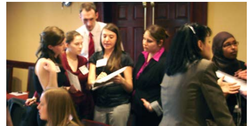
Caucusing in Palestinian Council