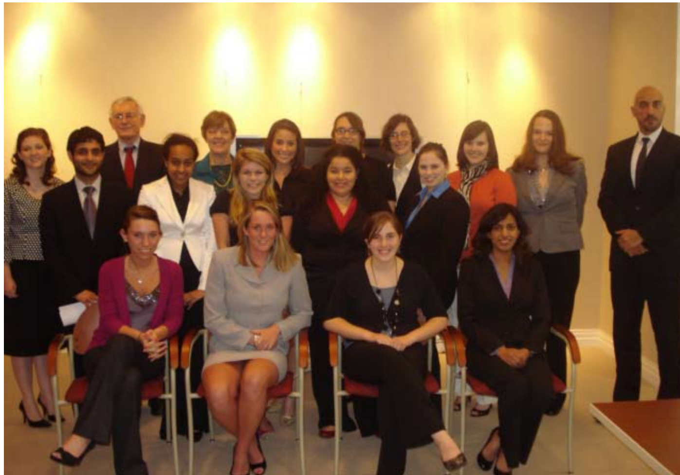
Converse Delegation at Qatar Embassy