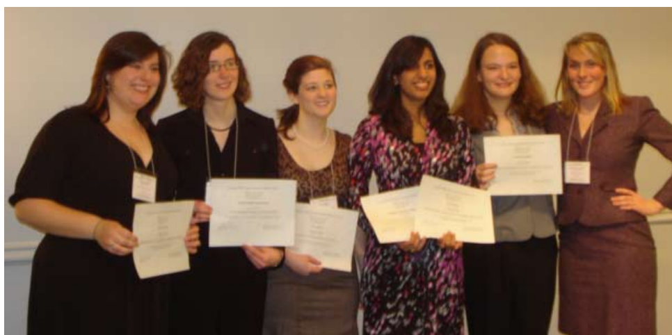
Qatar Delegation is Overall Outstanding Delegation at Southeast Regional Model.