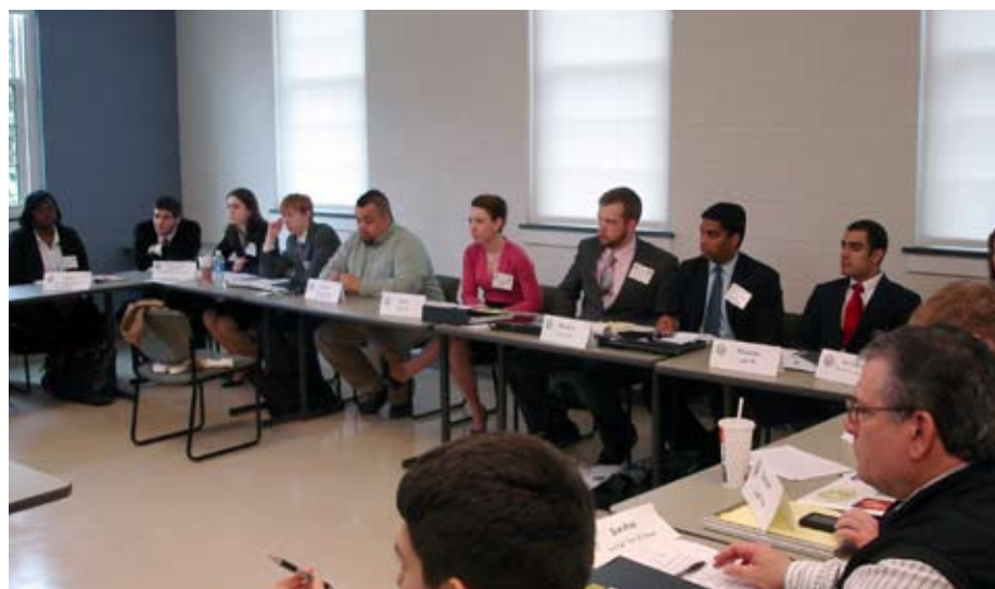
Nice Facilities for SouthEast Model Social Council