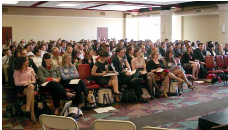
Chairs on 1st Row at Summit