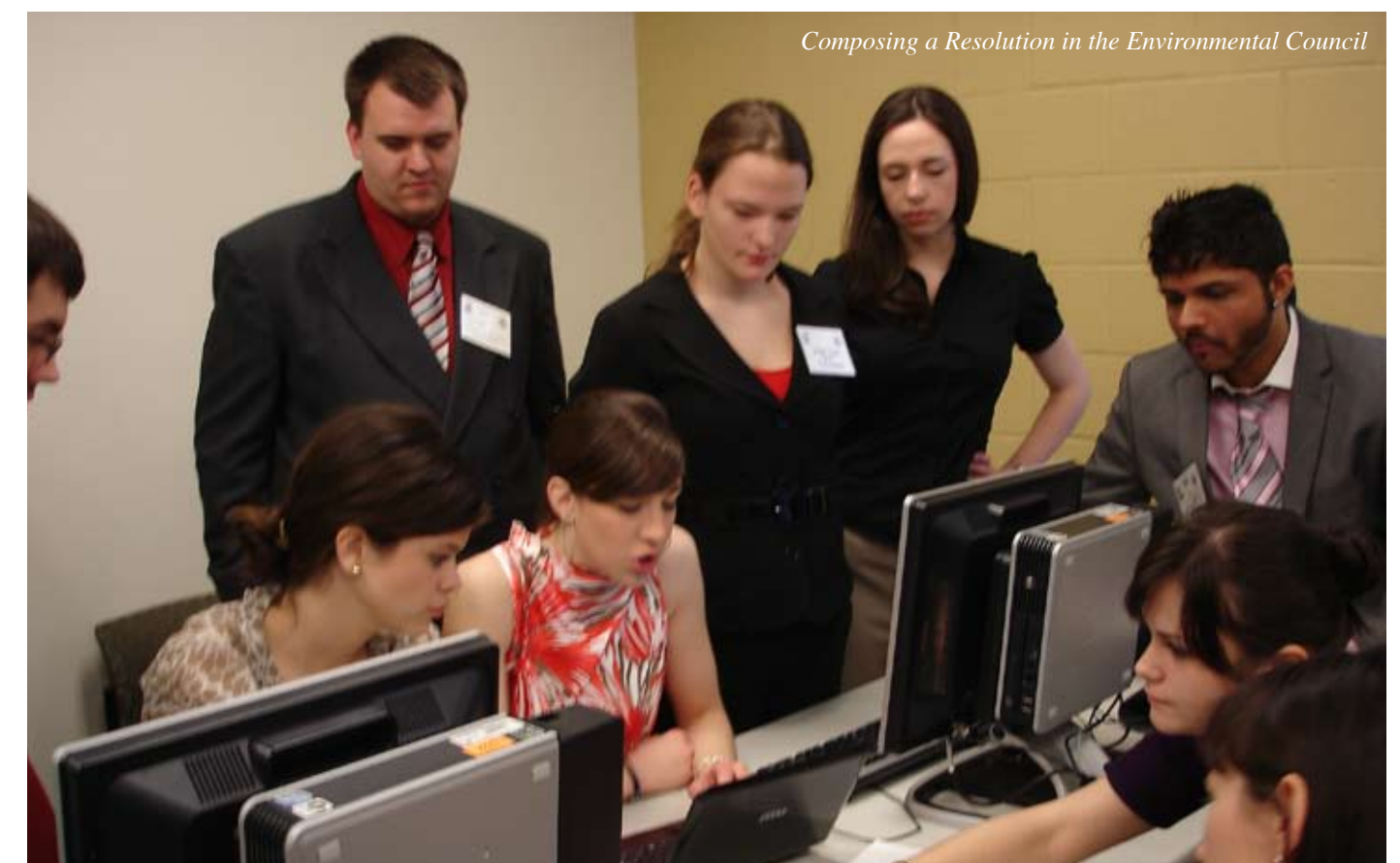
Composing a Resolution in the Environmental Council

The 25th Southeast Regional Model will meet, March 11-13, 2011, at Converse College.