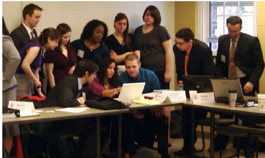
Large Caucus in Palestinian Council

development and young career. She emphasized how the skills gained and honed in debate, diplomacy, negotiation, writing, and leadership were important as she worked in the delicate environment of Kurdistan amidst the forging the new Iraqi nation.