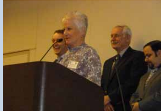
Morrison Recognized at National Model