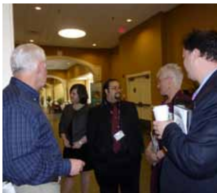
Faculty Confer at National Model

Turkey. Participating institutions were Northeastern University, University of Pittsburgh, Mount St. Mary's University, Roger Williams University, University of Utah, Northwestern University, University of Houston, Grand Valley State University, Mercer University, Pomona College, the United State Military Academy at West Point, Adrian College, Converse College, Kennesaw State University, George Washington University, University of Arkansas—Little Rock, American University of Cairo, Georgia State University, University of North Texas, University of North Carolina—Charlotte, Miami University, and Montana State University.