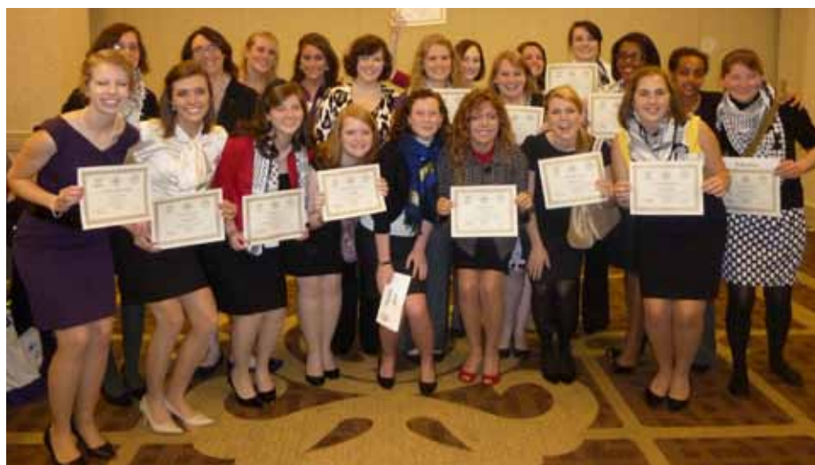
Converse Palestinian Outstanding Delegation at National Model