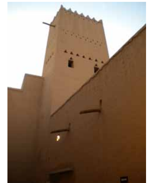
Two Buildings Reflect Saudi Architecture Ancient and Modern