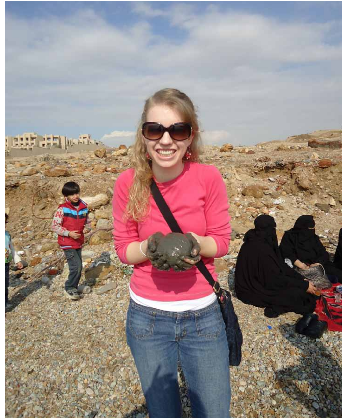
Dead Sea Mud

I have heard some Americans say that we are hated in the Arab and larger Muslim world, but in my travels I have found little evidence to support this conclusion. Whenever I attempted to speak Arabic with anyone, I would be asked, “Why are you learning Arabic?” Some of them viewed their language as irrelevant for an English speaker since English is the universal global language, but others expressed obvious excitement by the interest in the culture to attempt the language. While I will not generalize and say that all the people want to open themselves to western culture, I have sensed in my travels an affinity for the West. More importantly, I find that most people are looking for a human connection. They want to relate to you on the same levels that we relate to our immediate friends and family. They are looking to share, learn, and experience the world, just as we were in Jordan. Although traveling to a different culture is the first step, the real key is to interact and connect with the locals to truly understand the world around us on deeper social, political, and psychological level.