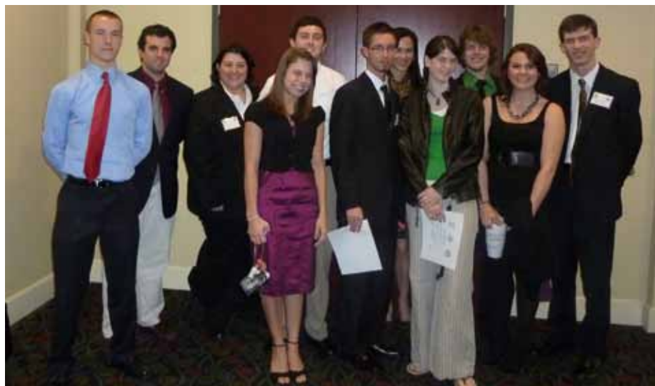
Spartanburg Community College First Time Delegation