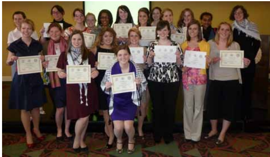
Converse Delegation at Southeast Model