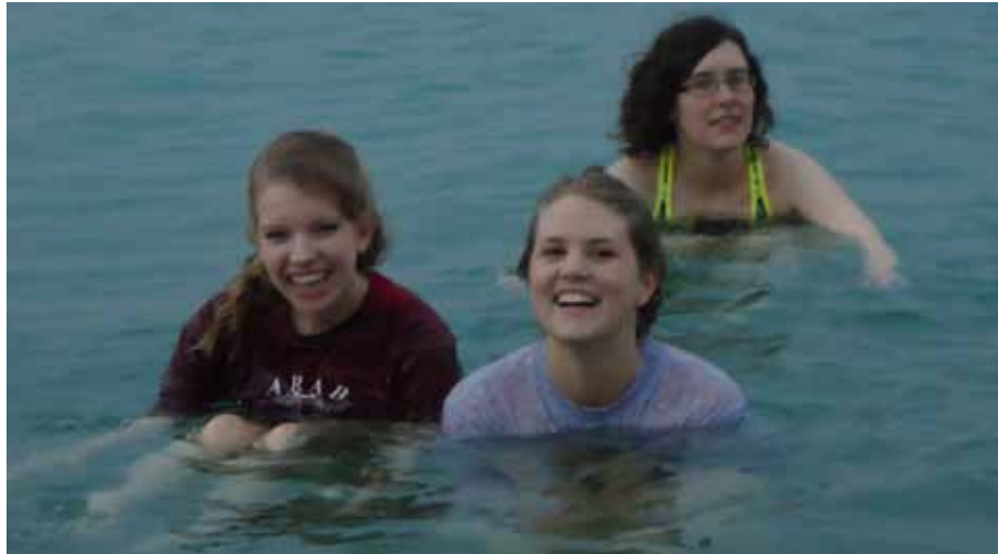
Floating in the Dead Sea