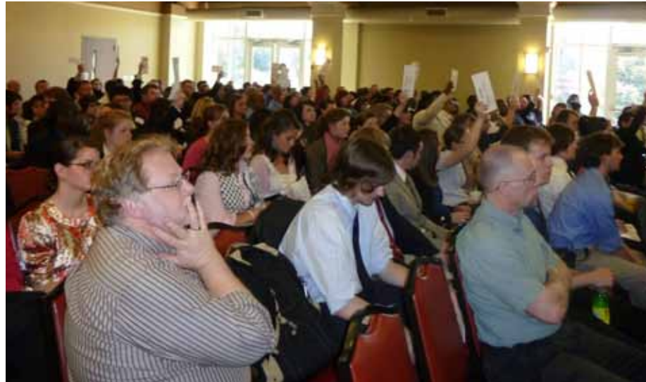
Southeast Model Summit