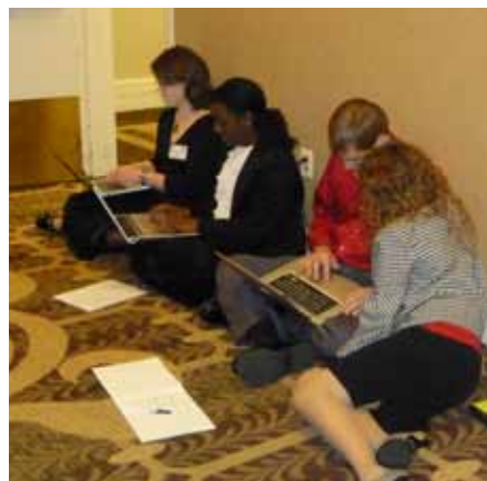
Preparing Resolutions for the Political Council