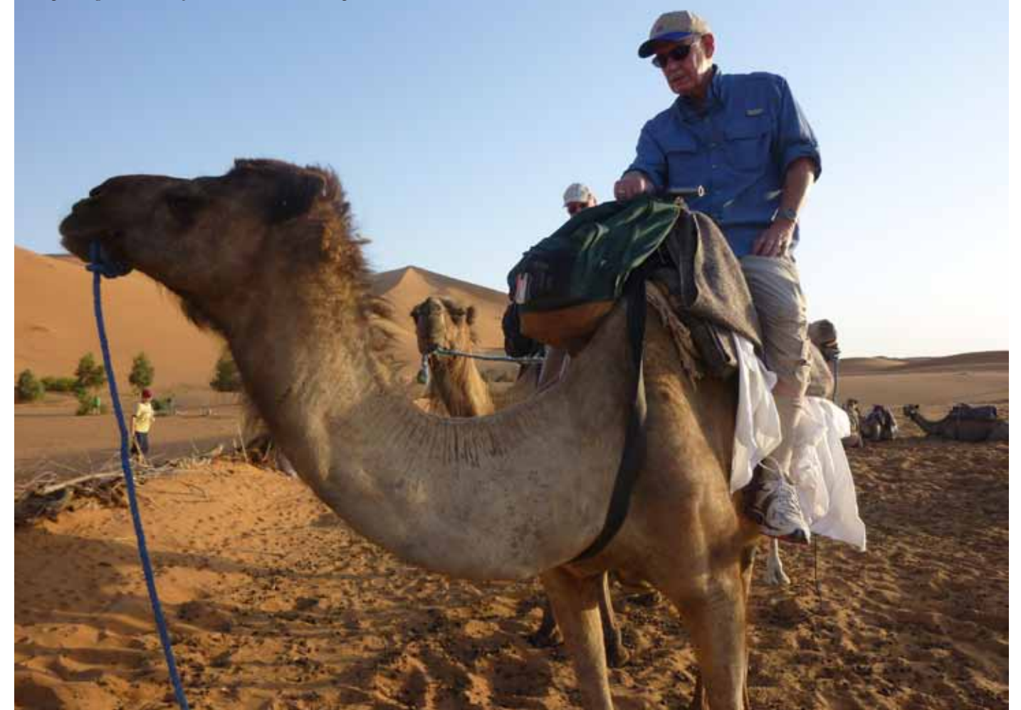
Preparing to Return from the Desert Camp

Although the character of the country remains decidedly rural, the majority of the population actually lives in urban areas. Casablanca (3.2 million population) and nearby Rabat (1.8 million) constitute the largest urban concentrations. The grimy starkness of poverty in Casablanca's large slums offered yet another perspective to our understanding of this diverse country. We spent only a brief evening in Casablanca before our late-night