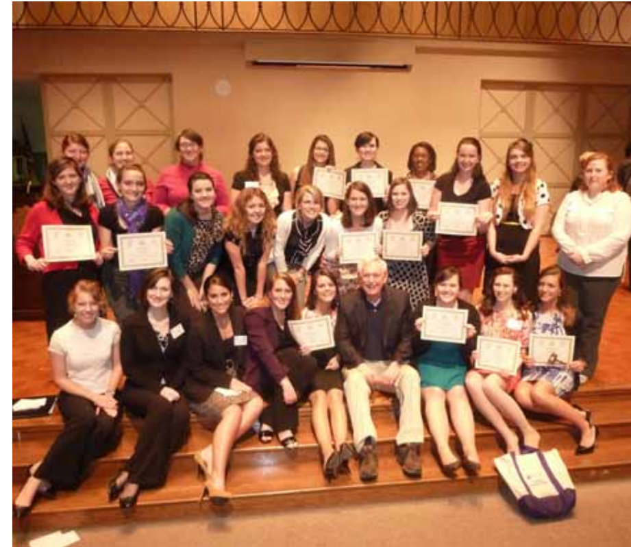
Converse Delegation at SERMAL