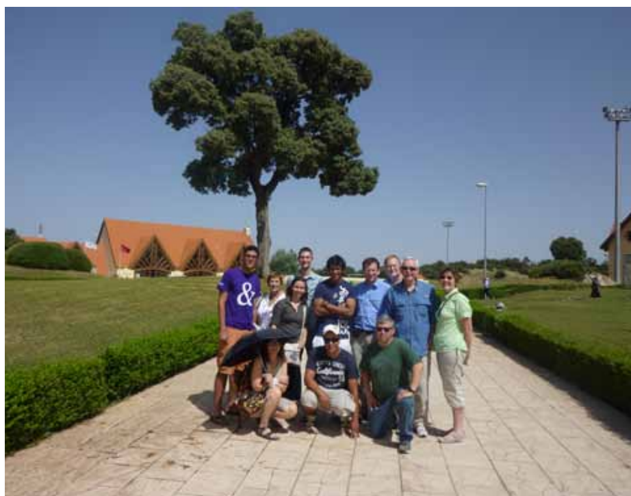
Group and Student Guides at Al-Akhawayn