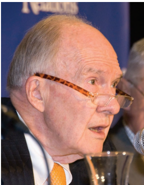
Lt. Gen. Brent Scowcroft (USAF, Ret.), President and Founder of the Scowcroft Group