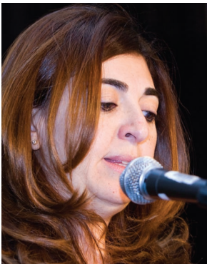
H.E. Houda Ezra Nonoo, Ambassador of the Kingdom of Bahrain to the United States