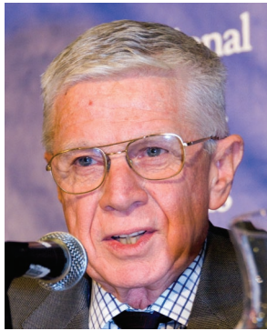
General Joseph P. Hoar (USMC, Ret.), former Commander in Chief, U.S. Central Command