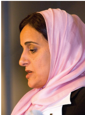
H.E. Sheikha Lubna Al Qasimi, Minister for Foreign Trade, United Arab Emirates