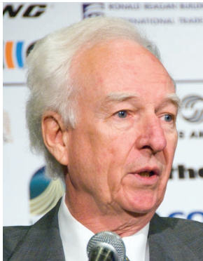
Ambassador Wyche Fowler, former U.S. Ambassador to the Kingdom of Saudi Arabia

ing a relationship between the United States and its Arab world strategic partners, friends, and allies that rests on as solid and enduring a foundation as possible. The annual Arab-U.S. Policymakers Conference is a central part of the National Council's mission to educate Americans about U.S. interests and involvement in the Arab countries, the Mideast, and the Islamic world.