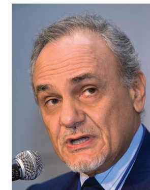
HRH Prince Turki Al Faisal, Chairman, King Faisal Foundation; former Ambassador of the Kingdom of Saudi Arabia to the United States