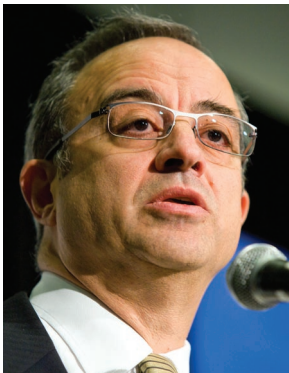
H.E. Dr. Marwan Muasher, Senior VP of External Affairs, The World Bank; former Foreign Minister of the Hashemite Kingdom of Jordan