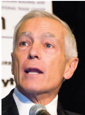
General Wesley K. Clark (USA, Ret.), Former NATO Supreme Allied Commander, Europe