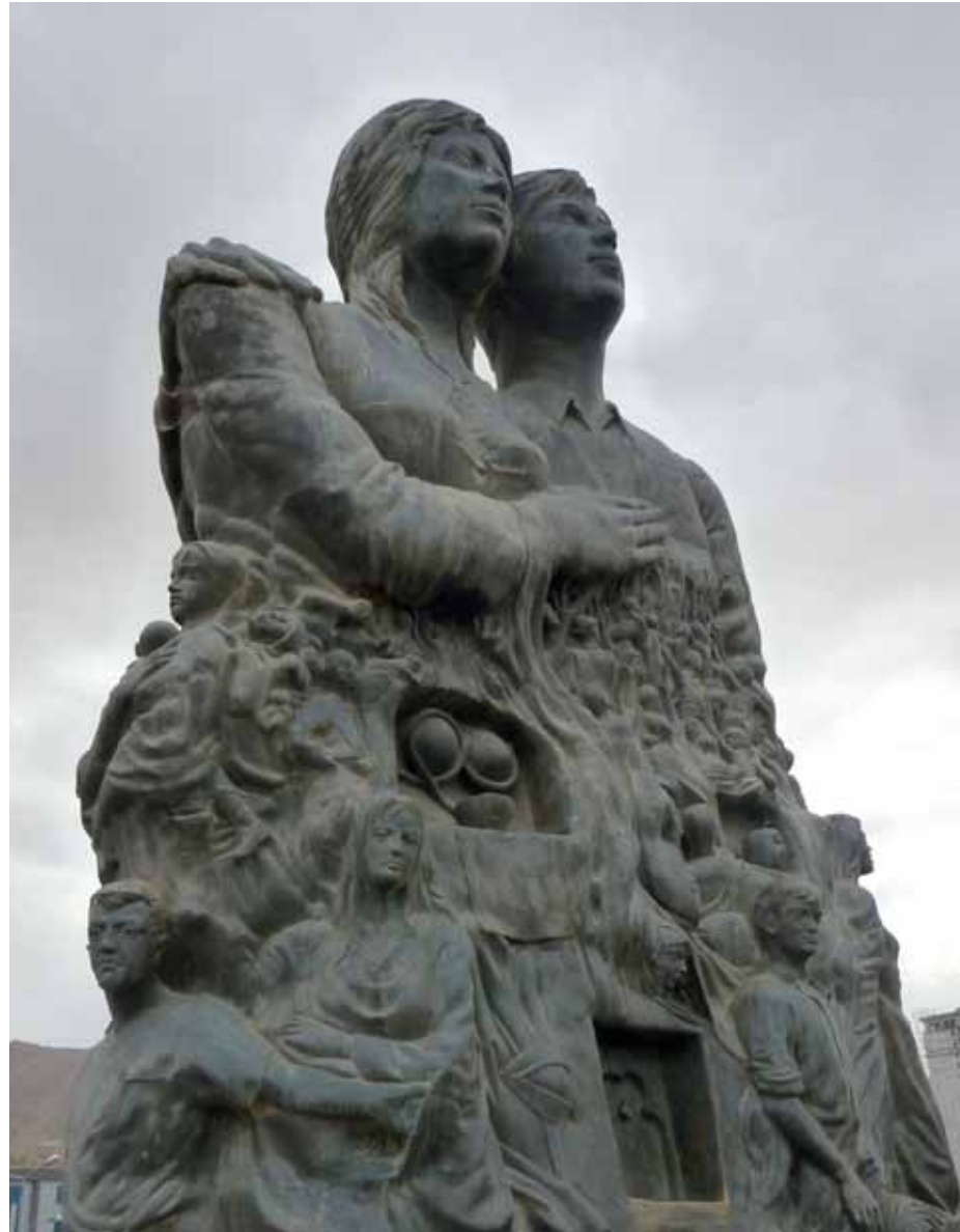
Monument in Tribute to Victims of Saddam's Anfal Genocide, Dohuk, Kurdistan

they were a Muslim, a Christian, and a Yezidi, but they loved each other and shared everything. We noted the difference in Archbishop Sako's focus on Iraqi citizenship and the theme at Dohuk that "we are the future of Kurdistan."