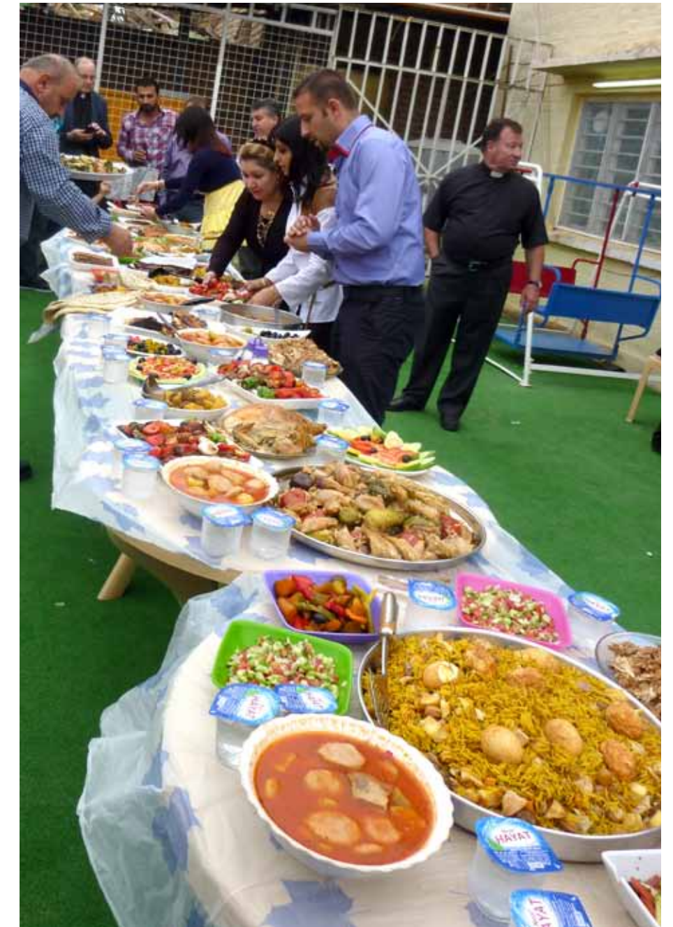
Lunch at Kirkuk Church