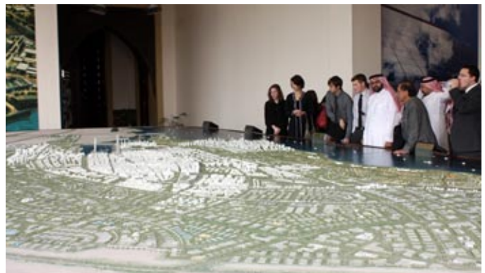
The Model Arab League delegation surveyed plans for King Abdullah Economic City before observing the actual progress on the ambitious project.