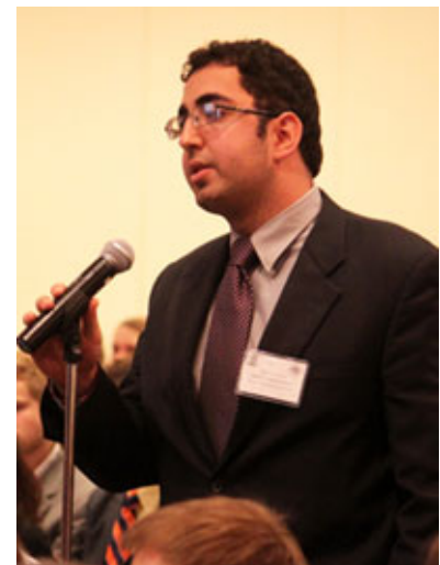
A student delegate makes a speech in favor of a resolution during the Closing Session of the National University Model at Georgetown University.