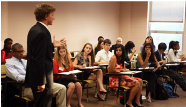
A student delegate speaks in support of a motion in the Political Affairs Council at the National High School Model.