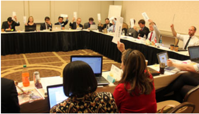
The Council on Social Affairs votes on a resolution at the National University Model.