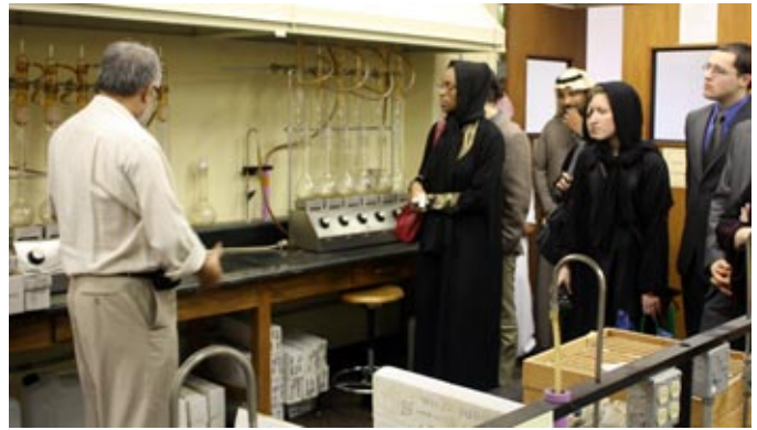
The delegation visited the Prince Sultan Center for Science and Technology in the Eastern Province.