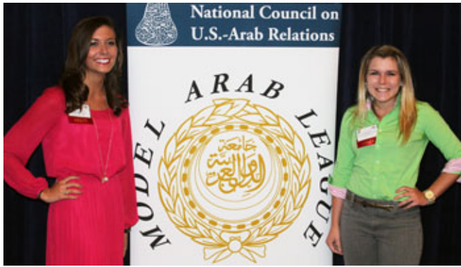
The National Council's Model Arab League annually includes the participation of more than 2,000 students throughout the United States.