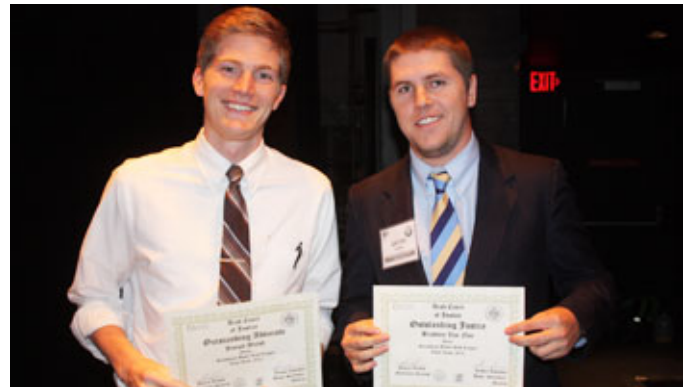
Students display their Outstanding Delegate certificates at the Southwest Model Arab League, held at the University of Arkansas at Little Rock.