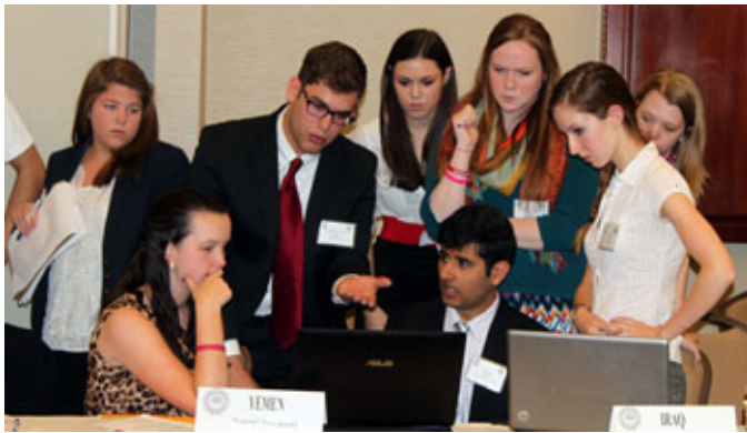
Students gather around computers to jointly draft a resolution in the Council on Environmental Affairs at the Ohio Valley Model in Oxford, Ohio.

From November 2011 through April 2012, the National Council sponsored and administered 15 Model Arab Leagues in 11 U.S. cities for 2,200 students in more than 100 American secondary schools and universities. University Model Arab Leagues were conducted in Boston, Massachusetts at Northeastern University; Allendale, Michigan at Grand Valley State University; Oxford, Ohio at Miami University; Spartanburg, South Carolina at Converse College; Washington, DC at Georgetown University; Little Rock, Arkansas at the University of Arkansas; Houston, Texas at the University of Houston; Oakland, California at Mills College; and Salt Lake City, Utah at the University of Utah. High School Models were conducted in Atlanta, Georgia at The Marist School; Boston, Massachusetts at Northeastern University; Little Rock, Arkansas at the University of Arkansas; Newport News, Virginia at Christopher Newport University; and Washington, DC at Georgetown University.