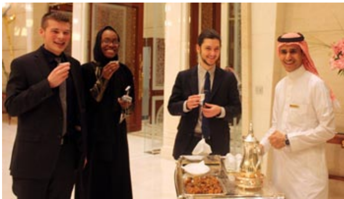
The National Council's university student study visit to Saudi Arabia provided the young American leaders -- each one an alumnus of the Council's Model Arab League Program and shown here enjoying Arabic coffee and dates -- a hands-on experience in the Arab world that many may have dreamed of but few others their age have had.