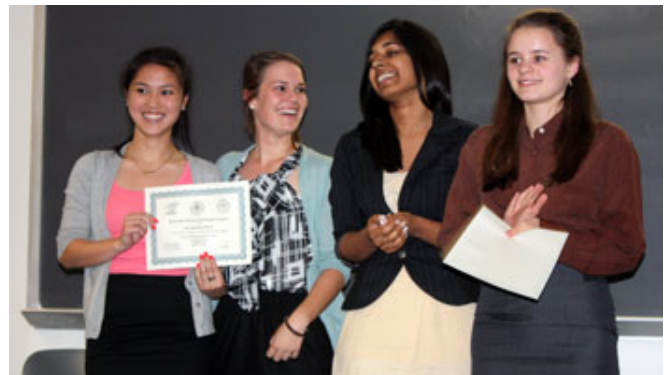
High school students from The Madeira School in Virginia accept Outstanding Delegate awards at the National Model.