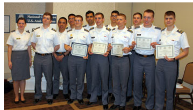
Cadets from the United States Military Academy at West Point display their Outstanding Delegation certificates from the National University Model.