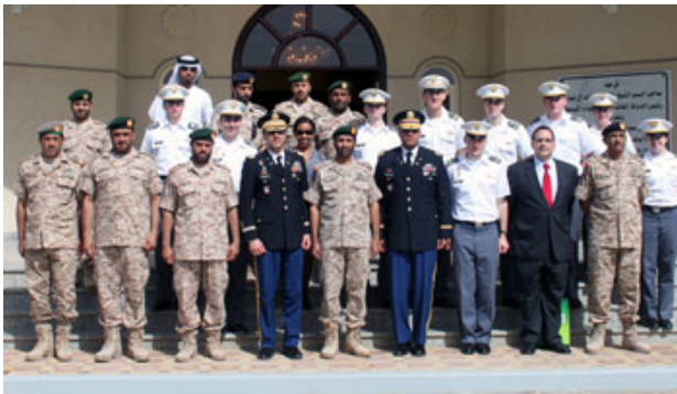
A U.S. Military Academy delegation visiting the UAE Zayed II Military College in Abu Dhabi during a Council study visit.

In the Council's 2011 ten-week summer internship programs that combined professional work experience in international affairs organizations with an academic seminar on Arabia and the Gulf, 12 of the 32 interns were Model Alumni. In the Council's first two cultural immersion visits for university students to Saudi Arabia in 2011, all 22 of the participants were Model Arab League Alumni. In addition, three Council 2011 Model Arab League participants were awarded an all-expenses paid six-week Arabic language fellowship, complete with home stays, in Oman; and (2) five dozen cadets and midshipmen from the U.S. Military Academy, U.S. Naval Academy, and U.S. Air Force Academy participated in separate Council two-week cultural immersion programs in the UAE in partnership with the internationally renowned Abu Dhabi-based Emirates Center for Strategic Studies and Research.