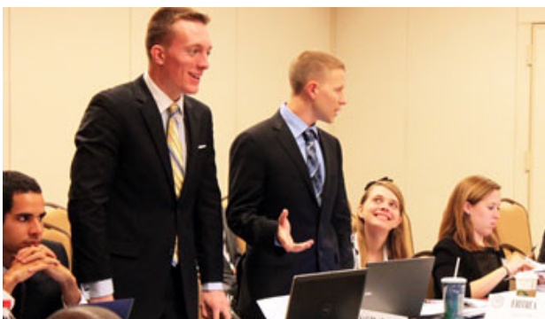
Student delegates representing Saudi Arabia make a speech in favor of a motion during the National University Model.

In preparation for participating in a Model, all the students are able to benefit from assistance provided by the National Council's national network of supporters and volunteers. For example, each of the participants is able to obtain additional assistance by accessing the Council's staff, the entirety of which is comprised of alumni of the Model Arab League Program. Many also gain from contacting the numerous Arab embassies that support the Models. Still others are guided by one or more of the faculty advisers in 800 American universities where alumni of the Council's Malone Faculty Fellows in Arab and Islamic Studies Program are resident. What makes the Fellows unique sources of information and insight is that that they have participated in the Council's educational and cultural immersion study abroad programs in one or more of the 12 Arab countries that have hosted the Fellows.