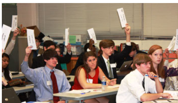
Students vote on a resolution in the Political Affairs Council at the Atlanta High School Model.

Grappling with the international challenges of representing the needs, concerns, interests, and foreign policy objectives of a government other than their own, and especially that of an Arab country, has obvious merit in and of itself. In the process, students not only deepen their knowledge and understanding of the Arab world and its peoples. In addition, they develop and practice useful analytical, organizational, writing, editing, and public speaking skills. In so doing they strengthen their ability to engage in the art of reasoned argument and spirited debate. In the process, they have an unparalleled opportunity to hone and refine leadership attributes that for many are often unavailable or otherwise difficult to acquire in the course of reading a book, viewing films, videos or television, listening to a specialist, participating in academic classes, attending briefings, or accessing blogs and the Internet.