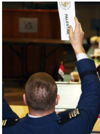
A student from the United States Air Force Academy, representing Palestine, raises his placard to vote on a resolution in the Social Affairs Council at the Ohio Valley Model in Oxford, Ohio.