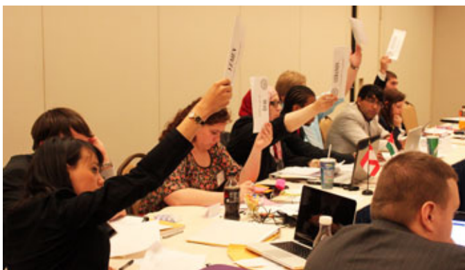
Students vote on an amendment to a resolution in the Council of Arab Environmental Affairs Ministers during the National University Model in Washington, DC.