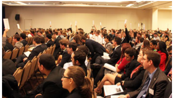
The National University Model in Washington, DC brings together more than 300 students from schools across the United States.