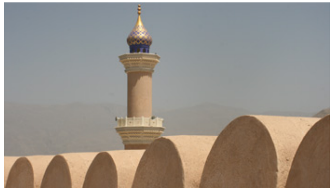
A view from atop the centuries-old fort adjacent to the Grand Mosque in Nizwa, historical capital of the former Ibadhi Imamate of Oman in the Sultanate's interior. A center of scholarly learning and traditional education, Nizwa has long been closely linked historically to Ibadhi communities in Algeria, Libya, East Africa, and elsewhere.