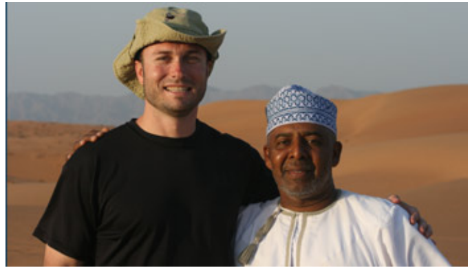
One of the National Council's U.S. Central Command Malone Fellows with the delegation's Omani guide during the delegation's stay in the Sharqiyyah Sands