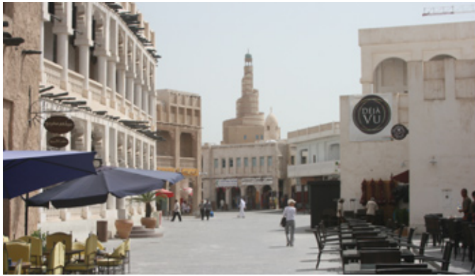
The Malone Fellows energy delegation explored the Qatari capital's traditional market and the country's world famous Museum of Islamic Art (below)