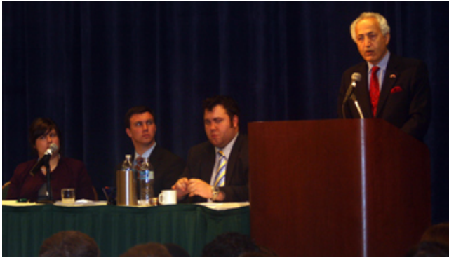
Ambassador of the Republic of Iraq to the United States H.E. Samir Shakir M. Sumaida'ie addresses the 2009 National Model Arab League