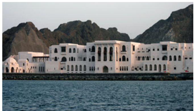
The waterfront of Muscat, capital of Oman and one of Arabia's most historically fabled ports.