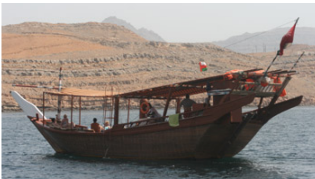
Malone Fellows spend two days and a night sailing on a traditional Arab dhow to, through, and from the Hormuz Strait, the world's most strategically vital waterway.