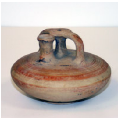
Item from the Dr. Joseph and Lois Malone Collection of Islamic and Pre-Islamic Pottery