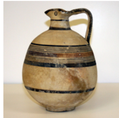
Item from the Dr. Joseph and Lois Malone Collection of Islamic and Pre-Islamic Pottery