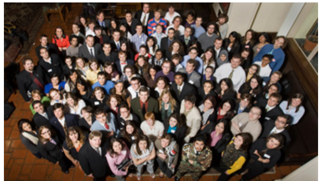
ABOVE: Student delegates at the 2009 West Coast Model Arab League at the University of California, Berkeley pose for a group picture