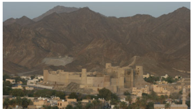
The inland fortress and traditional walled settlement of Bahla, presently under restoration, has been designated by the United Nations as a World Heritage Site.