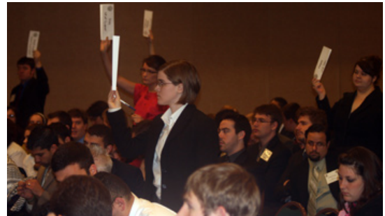
Student delegates cast their votes on a resolution during the Summit Session of the 2009 National Model