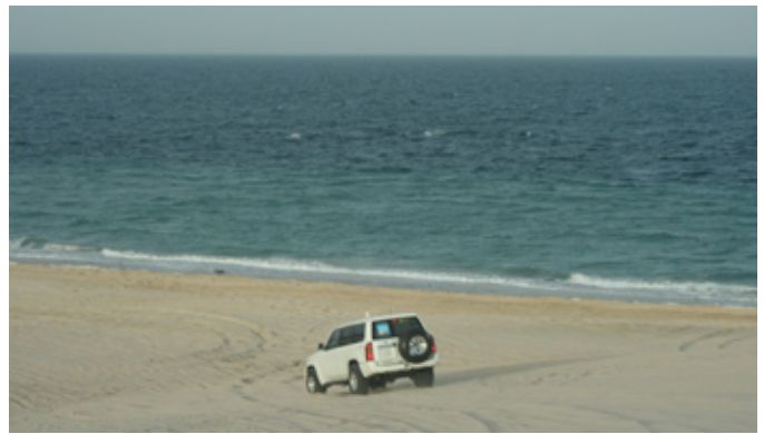
Malone Fellow energy leaders take to the desert in four-wheel drive vehicles to visit the border region adjacent to Saudi Arabia and the United Arab Emirates and to experience a traditional dinner in a tent.