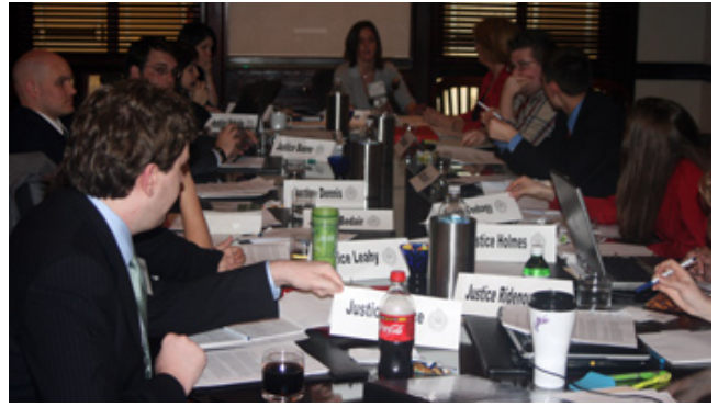
Student delegates deliberate in the Arab Court of Justice, a simulated international court that adjudicates disputes between Arab League member states, during the 2009 National University Model