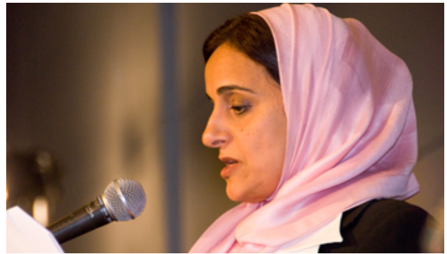
H.E. Sheikha Lubna Al Qasimi, United Arab Emirates Minister for Foreign Trade