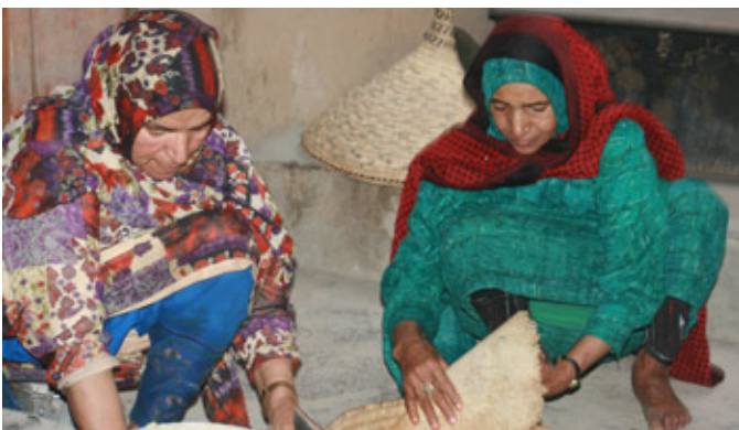
Omani craftswomen at work producing some of the Sultanate's traditional wares at a site in the town of Bahla.