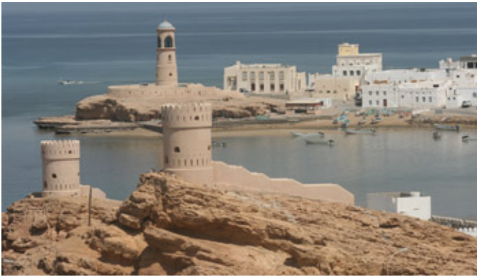
The Indian Ocean port of Sur, home to craftsmen of Oman's famous traditional wooden sailing dhows and its merchant captains of the sea who sail to and from the Gulf, Africa, India, Pakistan, and lands further east