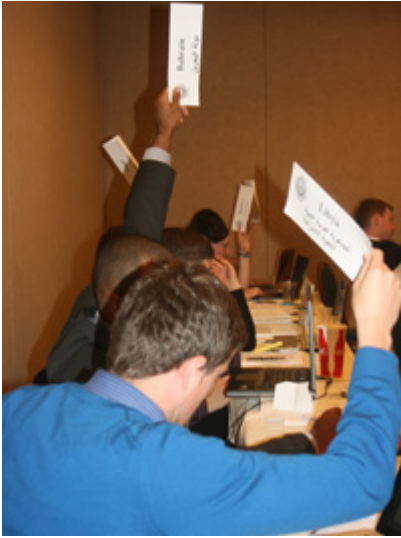
Delegates cast their votes on a draft resolution in the Council on Environmental Affairs at the National University Model