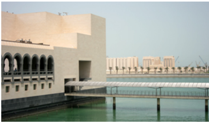
View from the Museum of Islamic Art in Doha, Qatar