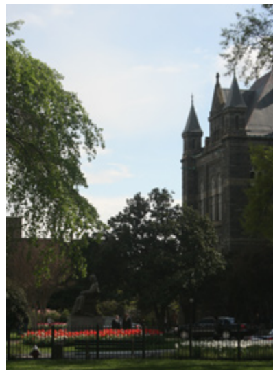
Georgetown University served as the host site for the 2009 National Model Arab League for university students March 26-28, and for high school students April 17-18