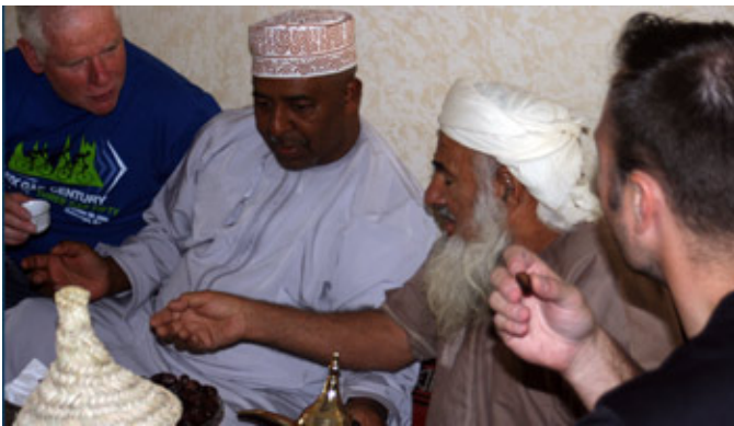
National Council Malone Fellows share tea and dates with their Omani hosts at a settlement deep in the Sultanate's interior.