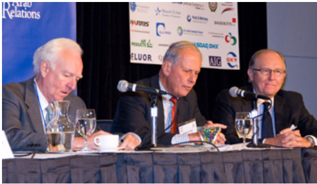
“Ambassadors Roundtable” – former U.S. Ambassadors to Saudi Arabia Wyche Fowler, Walter Cutler, and Robert Jordan (L - R)

Speakers at the 17th Annual Arab-U.S. Policymakers Conference included: