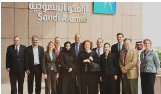
The National Council Malone Fellows delegation of U.S. corporate energy representatives visiting Saudi Aramco facilities in the Eastern Province of Saudi Arabia