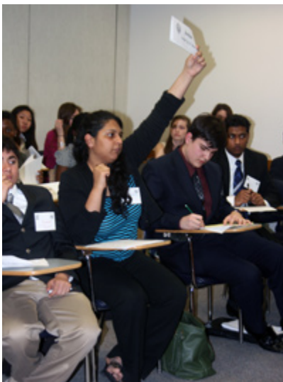
A student raises a point of parliamentary procedure in the Social Affairs Council at the 2009 National High School Model Arab League

From November 2008 through April 2009, the National Council sponsored and administered 12 Model Arab Leagues in 11 U.S. cities for 2,000 students in 200 high schools and universities. University Models were held in Boston, Massachusetts at Northeastern University; Allendale, Michigan at Grand Valley State University; Oxford, Ohio at Miami University; Denver, Colorado at Metropolitan State College; Spartanburg, South Carolina at Converse College; Washington, D.C. at Georgetown University; Houston, Texas at the University of St. Thomas; Denton, Texas at the University of North Texas; Berkeley, California at the University of California at Berkeley; and Missoula, Montana at the University of Montana. High School Models were held in Atlanta, Georgia at The Marist School, and in Washington, D.C. at Georgetown University.