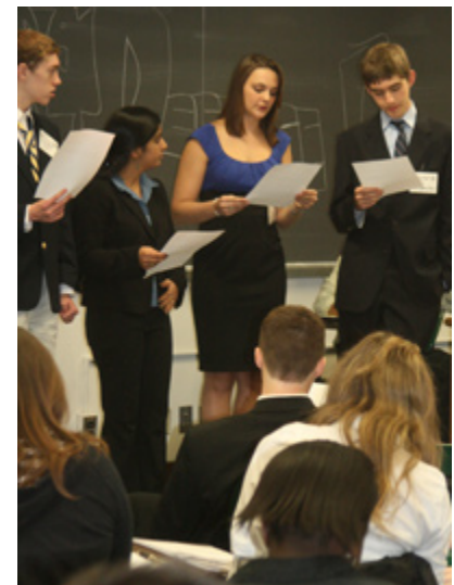
Student delegates introduce a draft resolution to the Political Affairs Council at the 2009 National High School Model