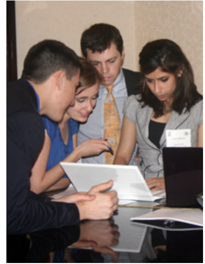
Student delegates discuss a draft resolution they intend to introduce to the Council on Economic Affairs at the 2009 National University Model