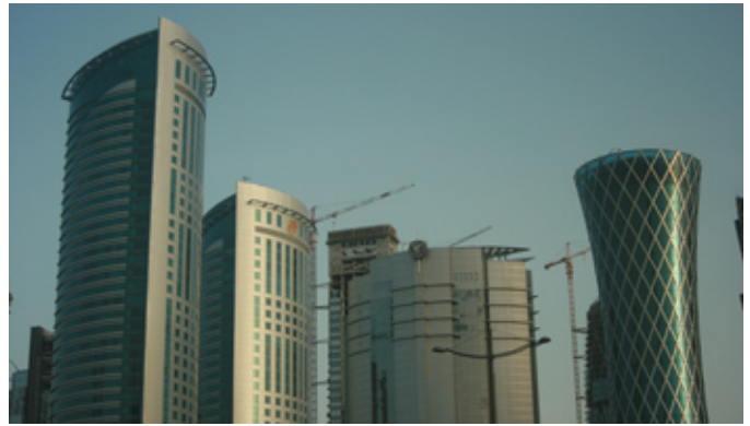
Construction cranes fill the Doha sky amid Qatar's extensive economic development and infrastructure expansion