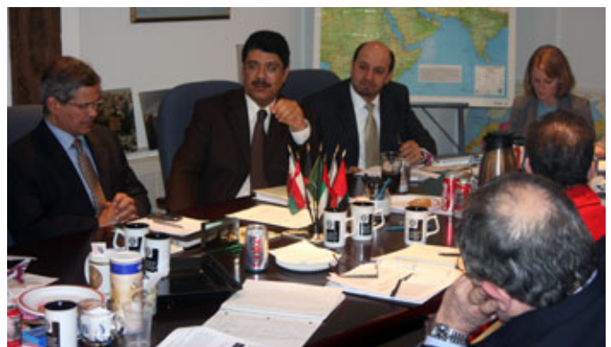
The corporate energy executives' pre-departure orientation program featured speakers from the government, business, and academic communities. Pictured here are officials of Saudi Arabia's Ministry for Foreign Trade, Ministry of Industry, and the Saudi British Bank.