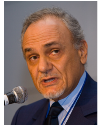
HRH Prince Turki Al Faisal Al Sa'ud, Chairman, King Faisal Centre for Research and Islamic Studies, Riyadh, Saudi Arabia; former Saudi Arabian Ambassador to the United Kingdom and the United States of America; former Director General, General Intelligence Directorate, Kingdom of Saudi Arabia