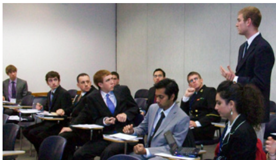
A student delegate makes a speech supporting a resolution in the Joint Defense Council at the Capital Area Model at Georgetown University

November 6-8, 2009 was a special three-day period. It joined the National Council, the Georgetown University Graduate School of Foreign Service's Center for Contemporary Arab Studies, and an impressive number of students from six universities in the mid-Atlantic region in a collaborative educational venture. The dates were those for the newest addition to the Council's now record 14 premier Arab-U.S. relations leadership development programs administered annually in cities and universities throughout the United States.