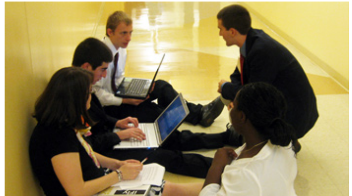
Student delegates in the Council on Palestinian Affairs collaborate in drafting a resolution.