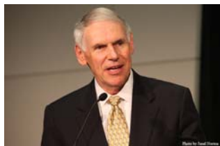
Admiral William J. Fallon (USN, Ret.), former Commander, U.S. Central Command addresses a luncheon session