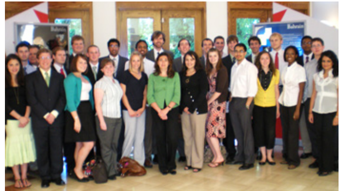
The interns pose with Bahraini Ambassador to the United States Houda Ezra Ebrahim Nonoo (center), who hosted and briefed them at the Embassy of Bahrain.