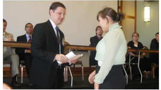
The Northeast Regional Model Secretary-General awards a certificate to a student delegate for outstanding representation of her country's policies and positions.

The 2009 Northeastern University Regional Area Model (NERMAL), convened at Northeastern University in Boston November 6-8, succeeded on multiple levels. Evidence of the growing interest and popularity of this particular Model was reflected in the fact that four more universities participated than the year before. In addition, the number of participants this year reached a record high. Student delegates debated and passed resolutions on numerous diverse topics reflecting the real-life domestic dynamics and policy challenges presently facing all 22 of the League's Arab member-states. Since the Model's completion, many of the new universities have joined veteran ones to indicate their intent to participate again in the 2010 Northeast Regional Model.