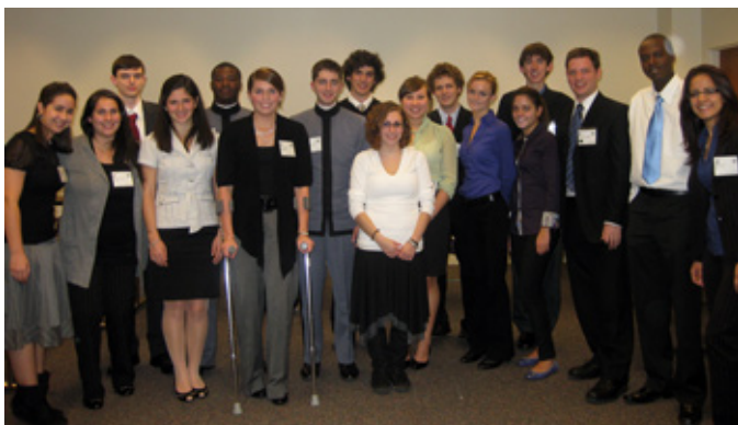
Student delegates from the Council on Political Affairs gather for a picture at the Northeast Regional Model Arab League at Northeastern University in Boston.