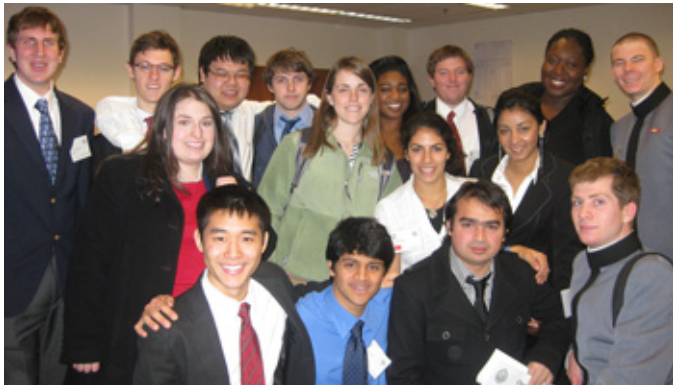
Delegates from the Joint Defense Council pose for a picture during the 2009 Northeast Model Arab League at Northeastern University in Boston, Massachusetts.