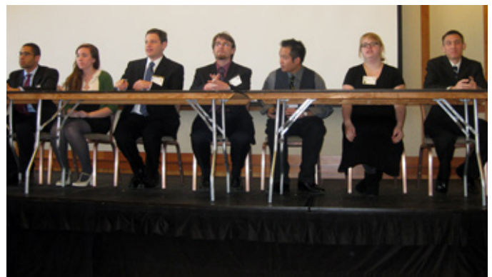
The Secretariat of the Northeast Regional Model Arab League presides over the Closing Plenary Session, where resolutions passed in councils come before the entire body for a final vote.