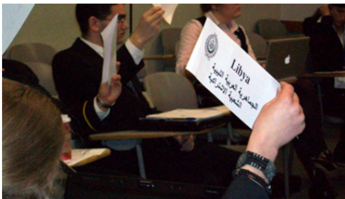
A student delegate representing Libya casts a vote in the Council on Political Affairs at the Capital Area Model.

"Two other values also result. One is an understanding of what goes into forming a successful coalition. Ordinarily, if there are no abstentions in a Model comprised of delegations representing all 22-country League Arab States, the goal of each delegation is to obtain the support of at least 11 other delegations than one's own in order for their resolutions to be accepted as policy. The other value underscores the truism that 'democracy is not a spectator sport – that to obtain the results one seeks, one has no choice but to participate."