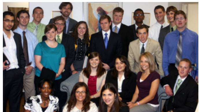
The interns pose for a group picture during a briefing at the National Council's office.