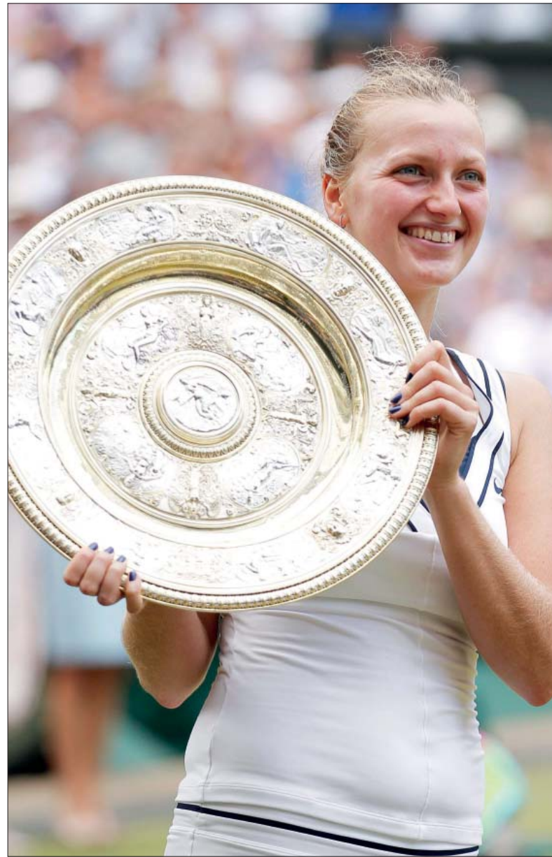
Petra Kvitova of the Czech Republic with the championship trophy following her victory over Maria Sharapova of Russia in the women's singles final at Wimbledon in London yesterday. Kvitova stunned favourite Sharapova to win her first Grand Slam title with a 6-3, 6-4 victory in the women's singles final. The 21-year-old eighth seed became only the third Czech woman to triumph at Wimbledon after nine-time champion Martina Navratilova and Jana Novotna. Page 44